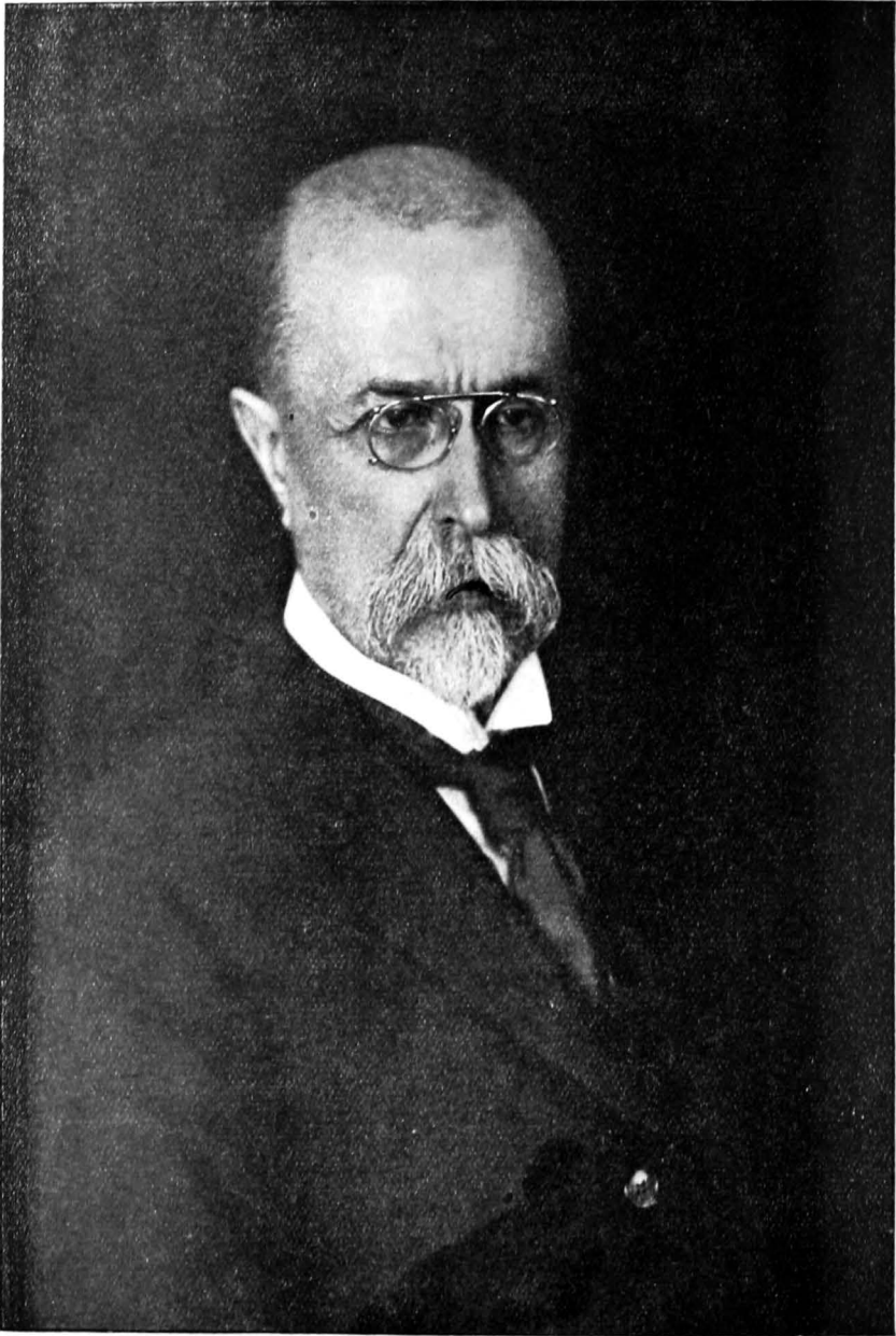
T. G. MASARYK, the First President of the Czechoslovak Republic.