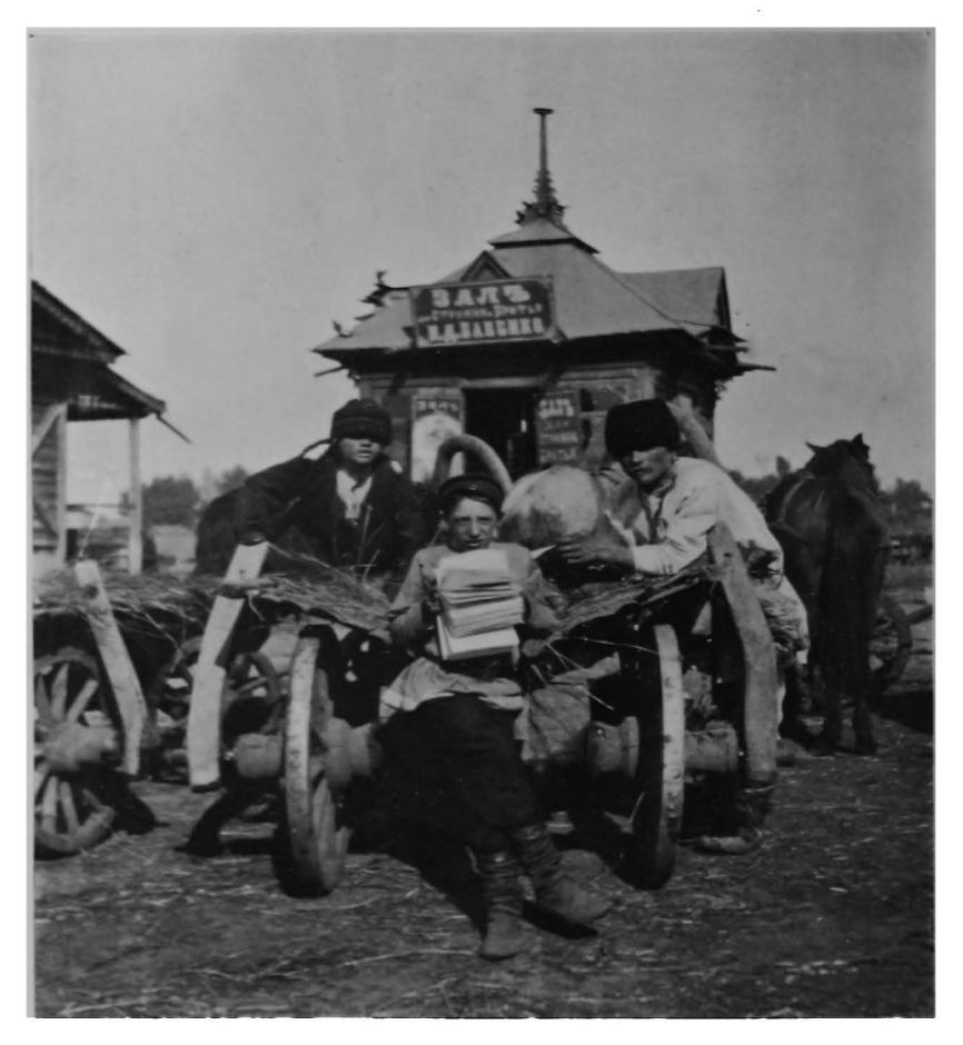
"THE LATEST FROM THE FRONT." READING THE WAR TELEGRAMS IN THE BAZAR.