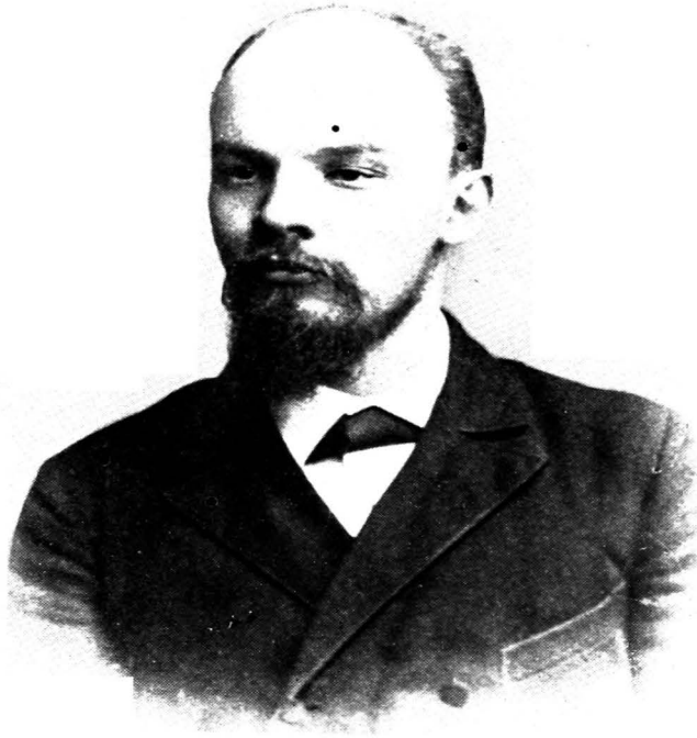
V. I. LENIN—1900