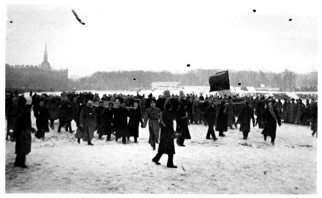
FUNERAL OF THE VICTIMS OF THE REVOLUTION. CARRYING THE COFFINS TO THE BURIAL PLACE