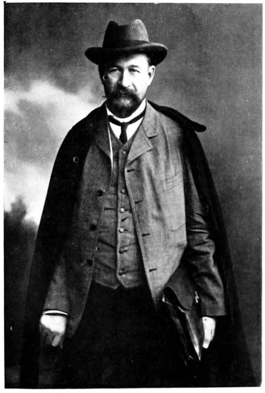
PRINCE GEORGE E. LVOFF