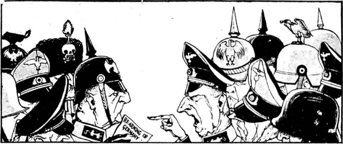
'For just this once,' Herr Colonel-General, can't you FORGET the panzer strategy through the Low Countries to Dunkirk?'

his anxiety lest, even if Germany's admission to the Council of Europe were to become a fact, Germany still might not take her seat until August or September of 1950. Mr. Churchill felt that 1950 might well prove to be a critical year; and he considered that it would be a great benefit if the meeting of the next Assembly could be brought forward so that German representatives might be introduced at the earliest moment.