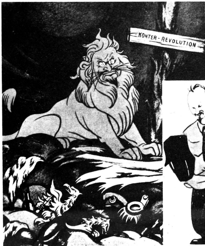
The Lion Trotsky crushing the counter revolution