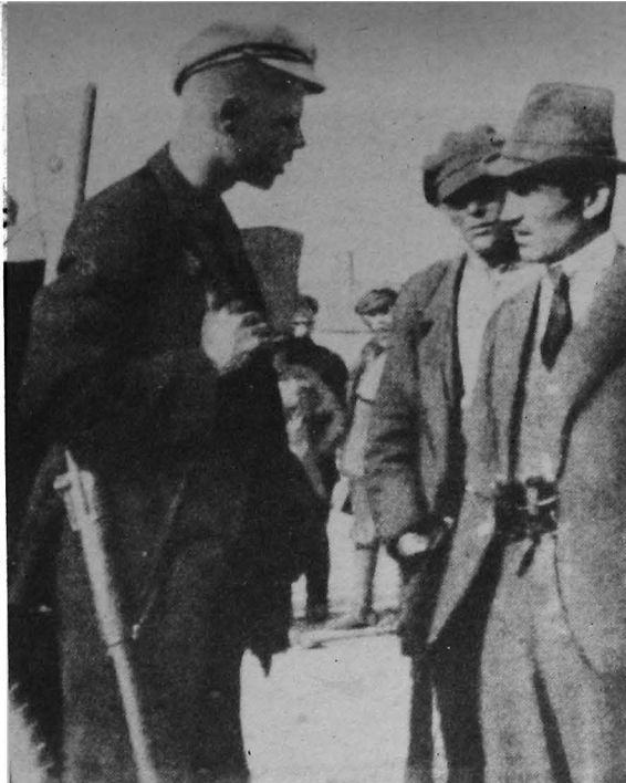
Max Hoelz, Central Germany, March 1921