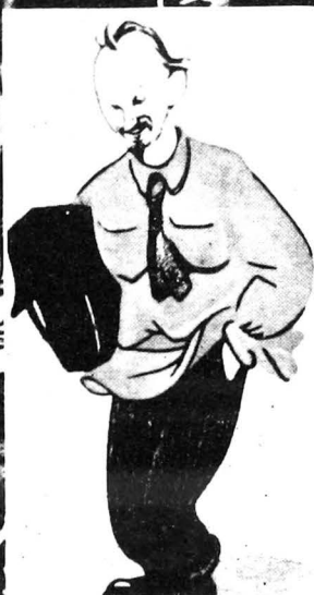
Bukharin Early Bolshevik cartoons