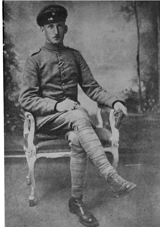
Albert Leo Schlageter