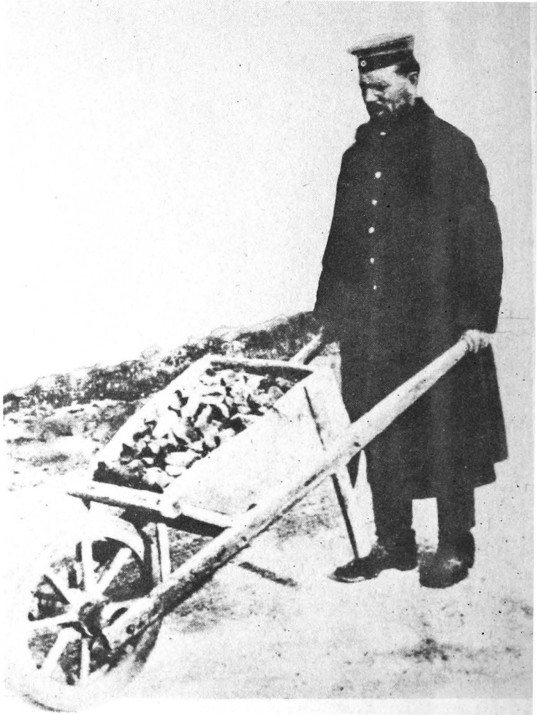
Karl Liebknecht in a punishment company