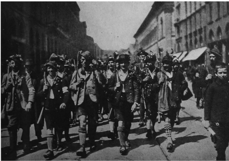
Freikorps marching in Munich, 1919