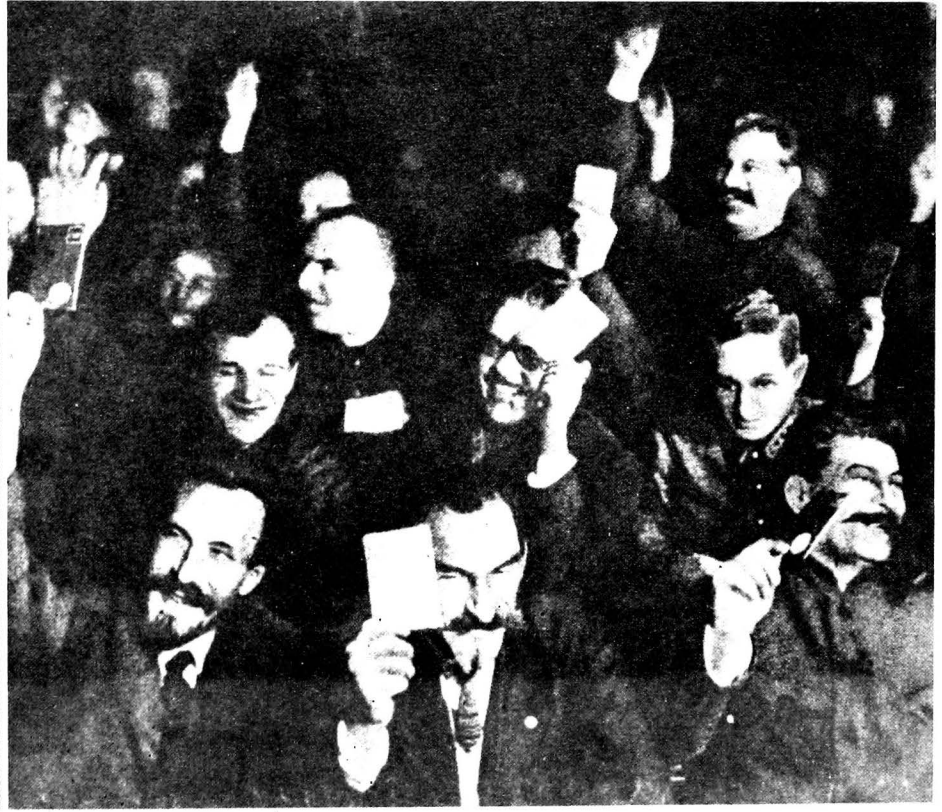
General Secretary Stalin voting for his reelection, Fifteenth Party Congress, Moscow, 1927