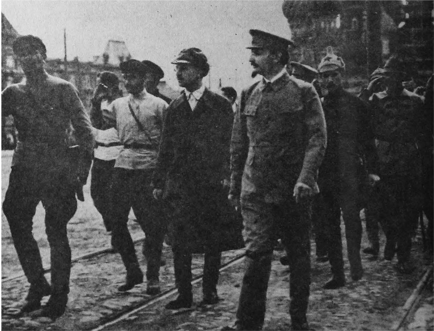
Trotsky, Commissar for War, crossing the Red Square, 1921