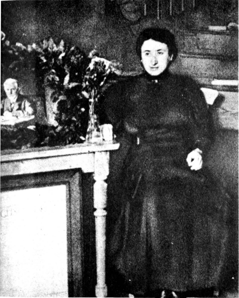
Rosa Luxemburg at an August Bebel memorial, about 1912