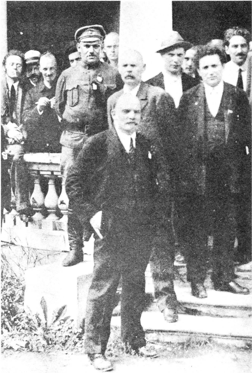
Bolshevik leaders, 1919