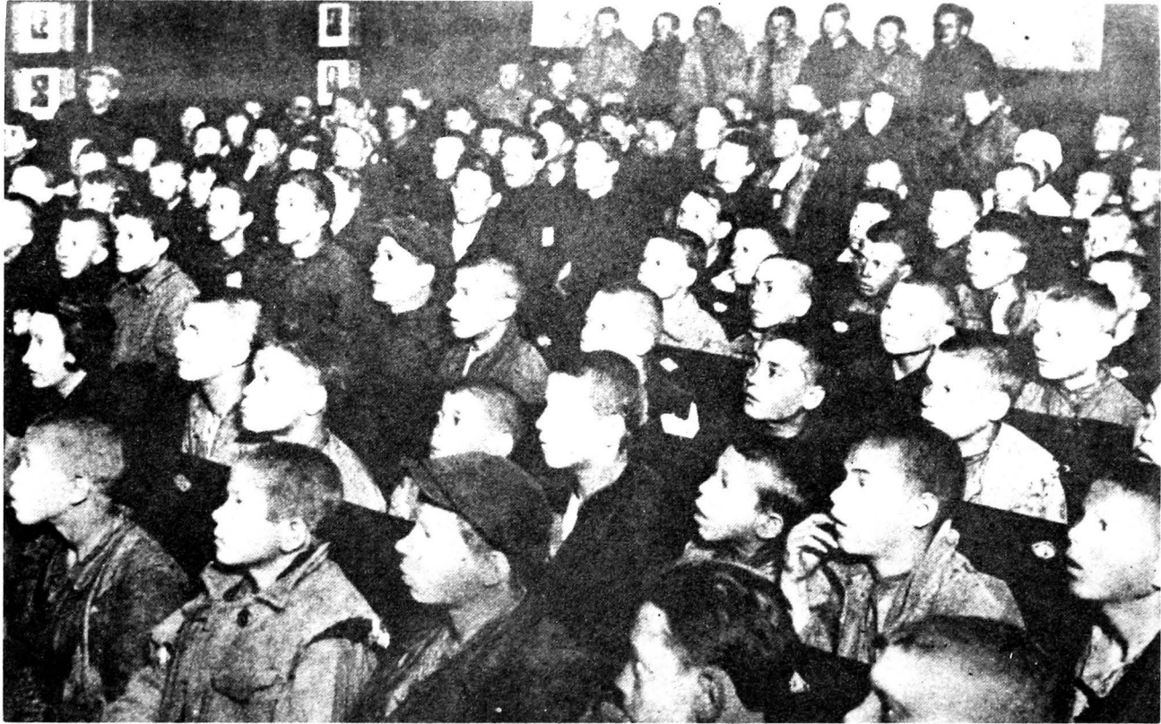
A GPU school