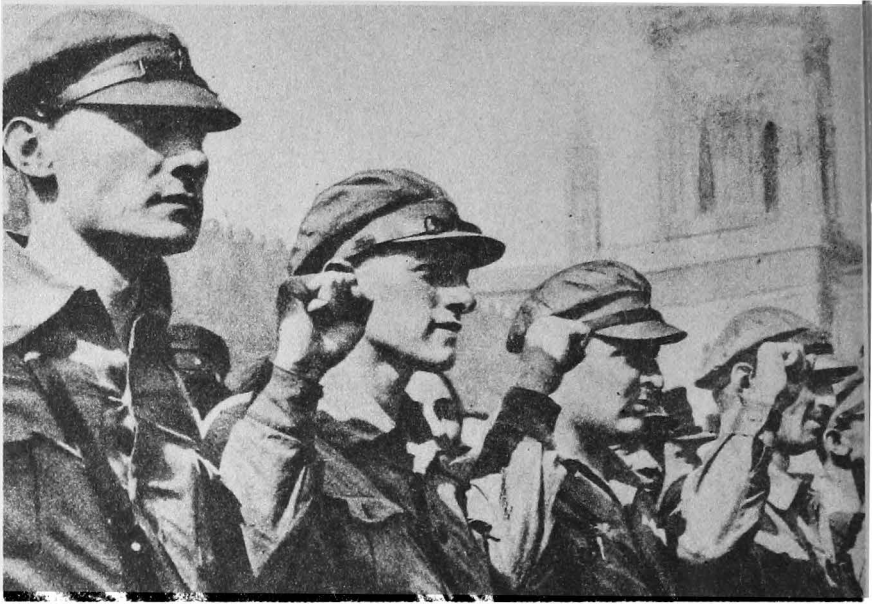
Red Front Fighters