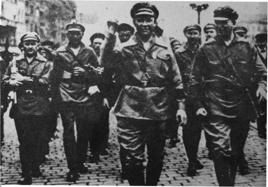
Thälmann marching at the head of the Red Front Fighters