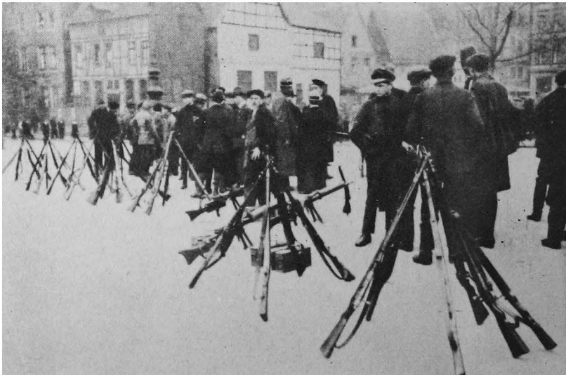
The Red Army in the Rhine-Ruhr, 1920