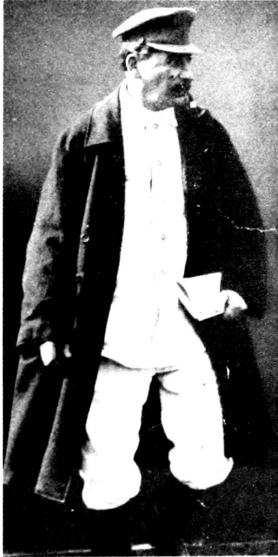
Stalin, about 1927