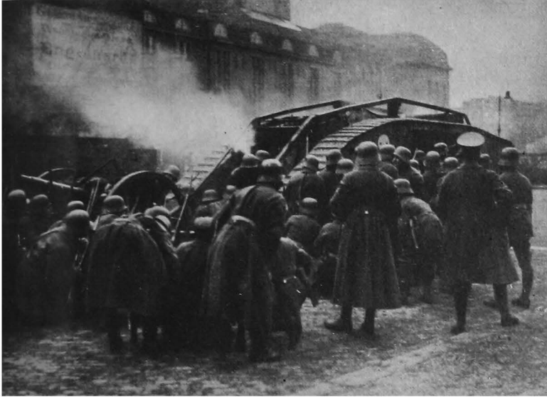
Freikorps troops in Berlin, 1919