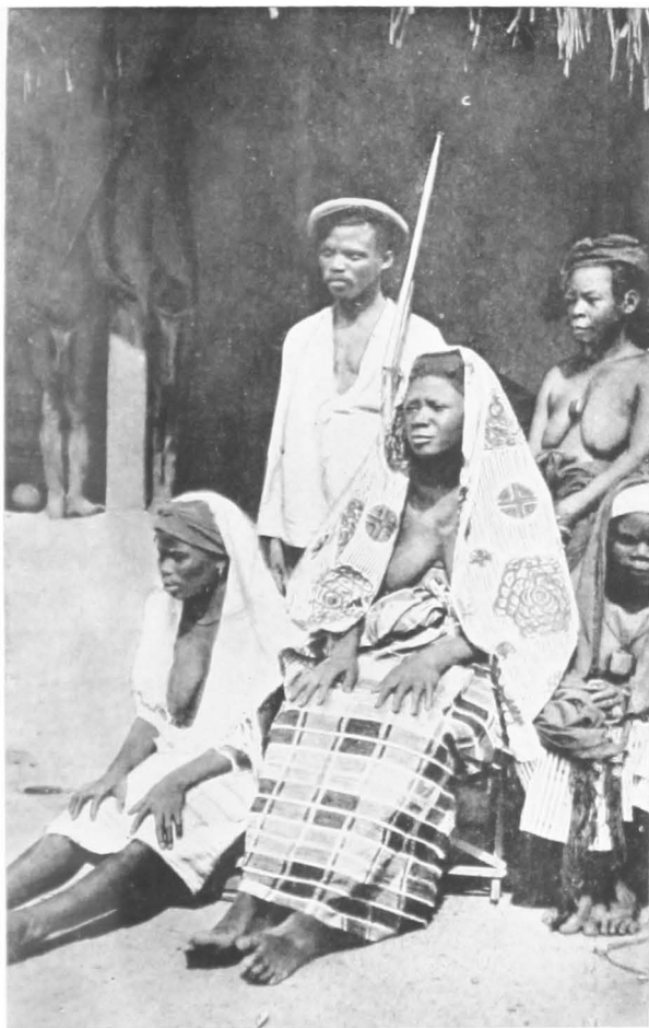
A LOCAL "QUEEN," ST. PAUL RIVER.