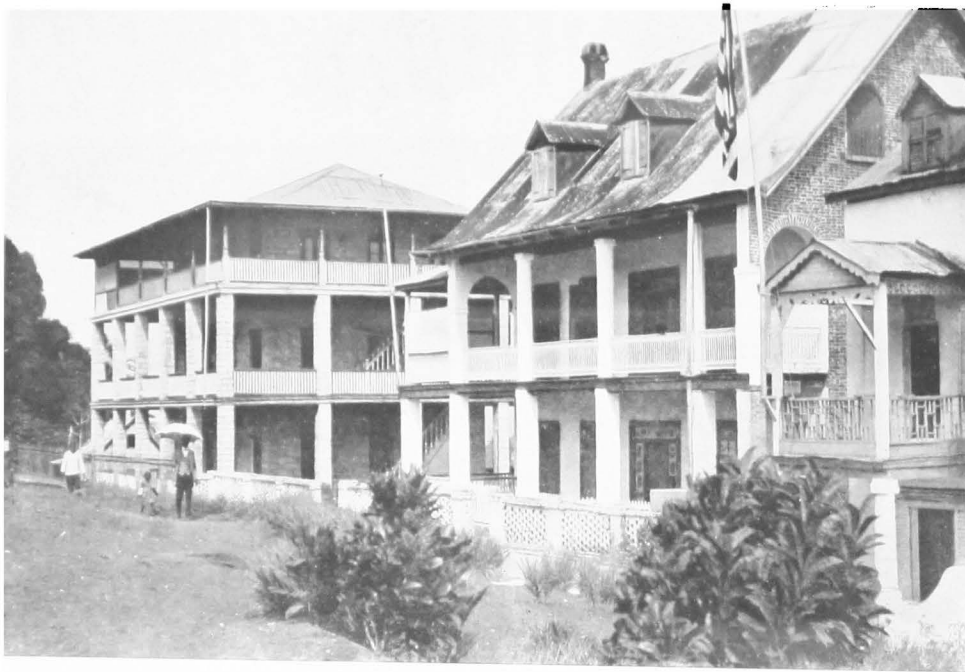
HOUSES IN MONROVIA, THE LIBERIAN CAPITAL.