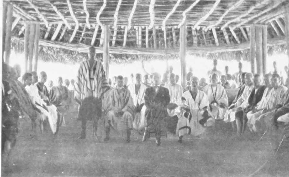
A PALAVER WITH CHIEFS, UPPER LIBERIA (FRANCO-BRITISH FRONTIERS).