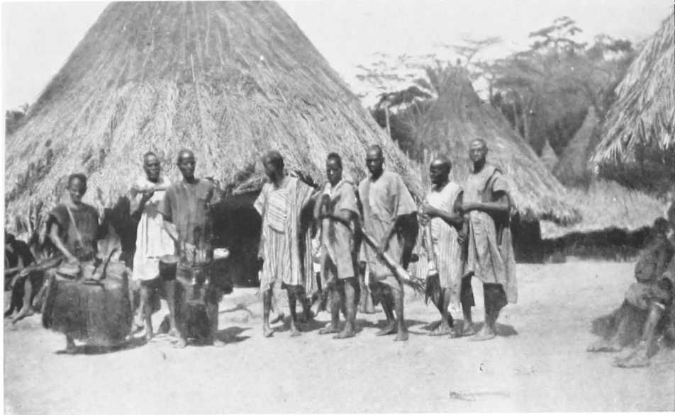
VILLAGE AND NATIVES, LIBERIAN INTERIOR.