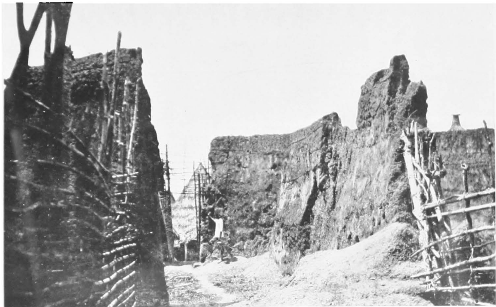
MUD WALLS ROUND A VILLAGE, FRANCO-LIBERIAN BORDER.