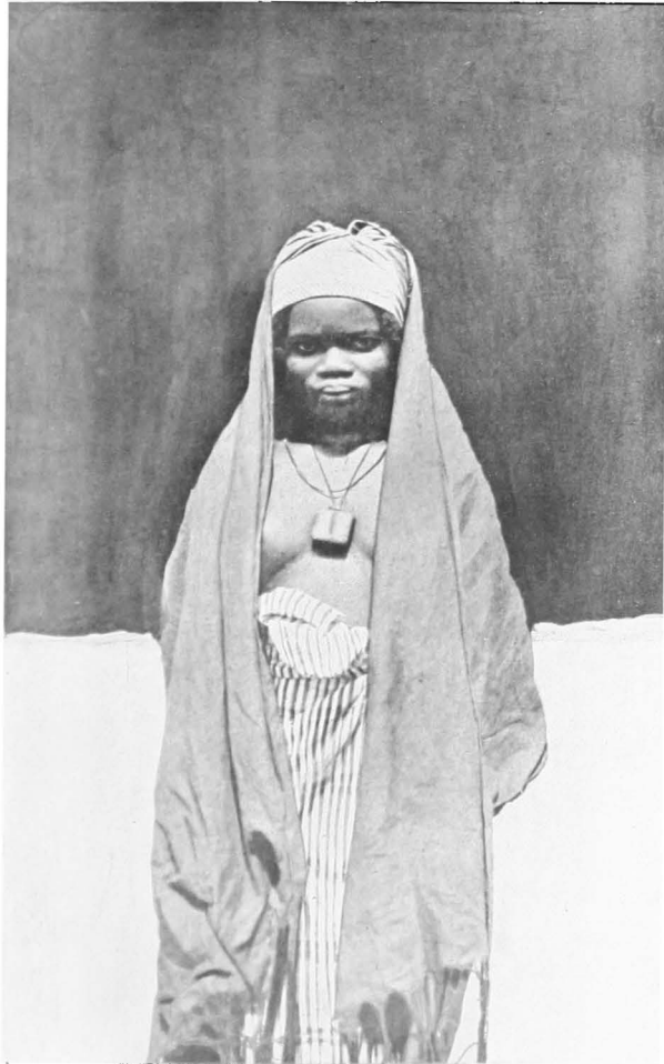
A "KING'S" DAUGHTER, MIDDLE ST. PAUL VALLEY.