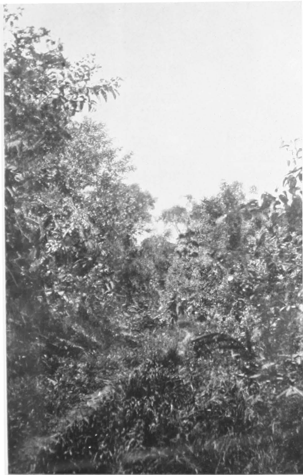
A LIBERIAN "ROAD" NEAR THE COAST.