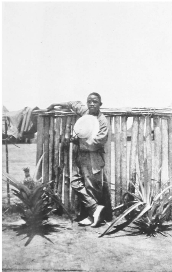
A "CIVILISED" LIBERIAN.