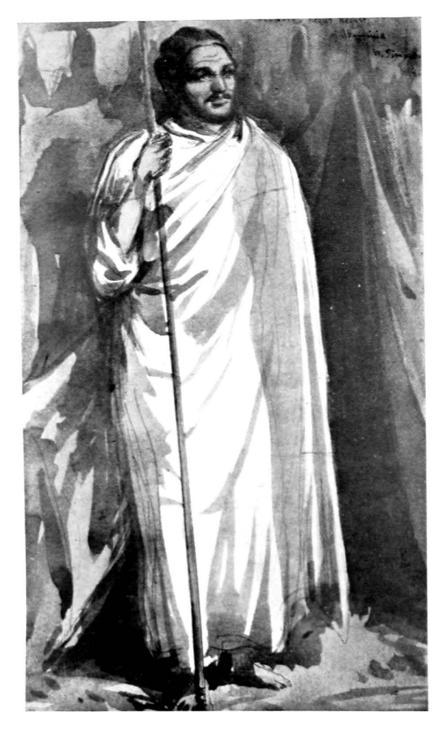
THE EMPEROR THEODORE