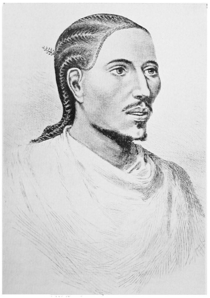
[From volume 2 of Sir E. A. Wallis Budge's "History of Ethiopia" by kind permission of Messrs. Methuen & Co. Ltd.