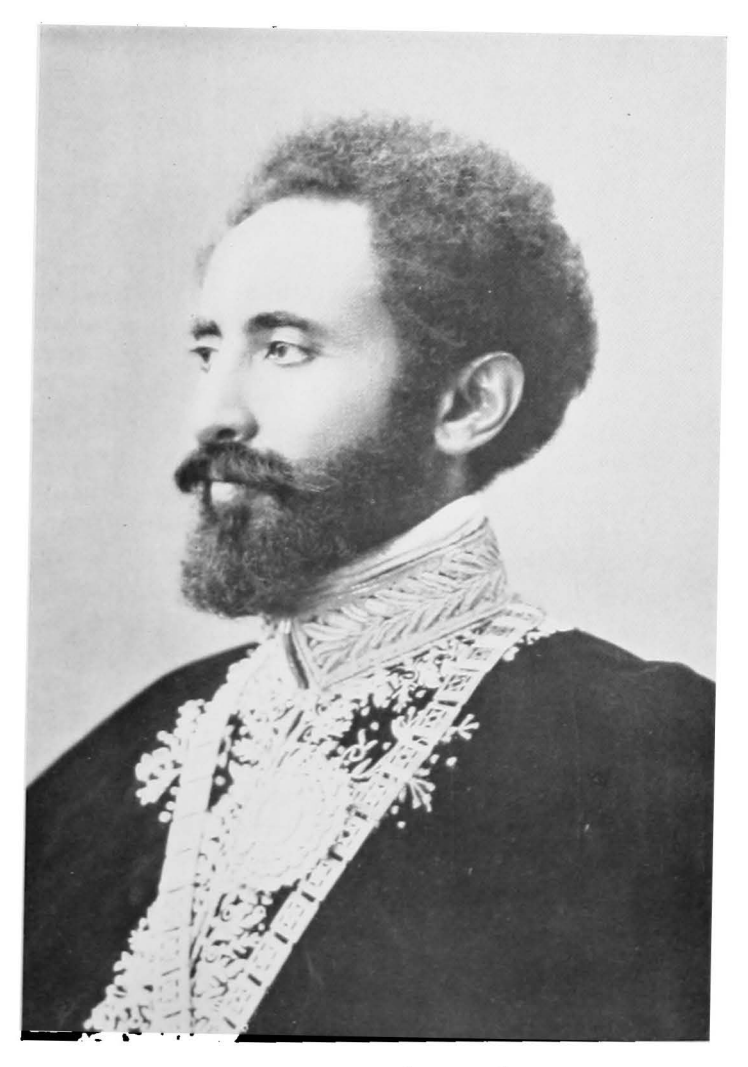
THE EMPEROR HAILÉ SELASSIÉ