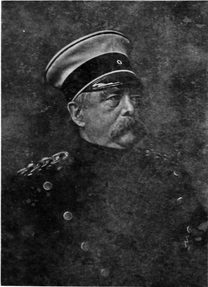
BISMARCK IN 1877