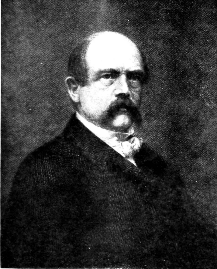
BISMARCK IN 1868