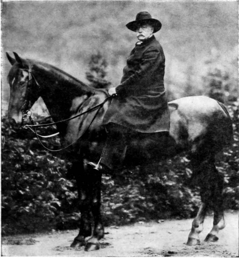
BISMARCK IN 1890