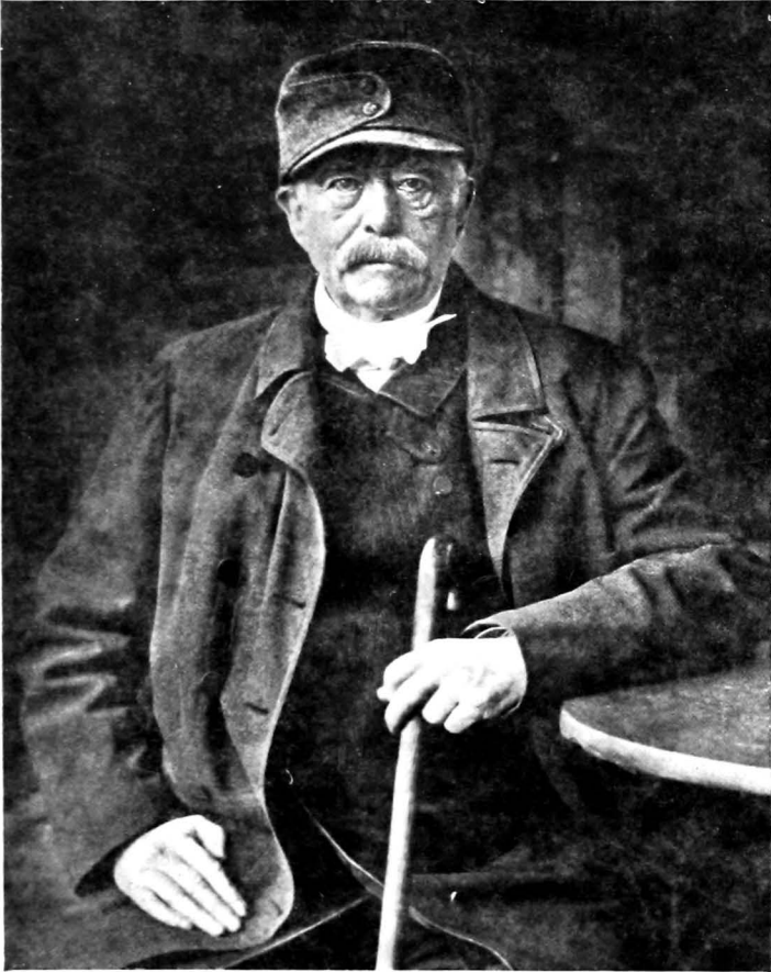
BISMARCK IN 1894