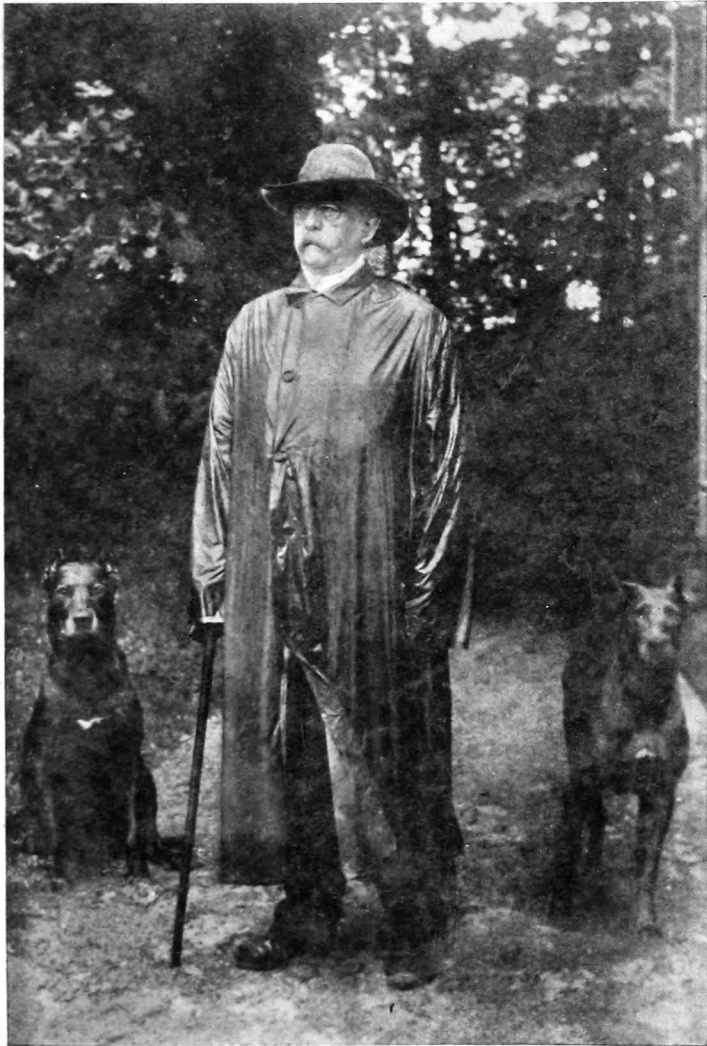
BISMARCK IN 1886