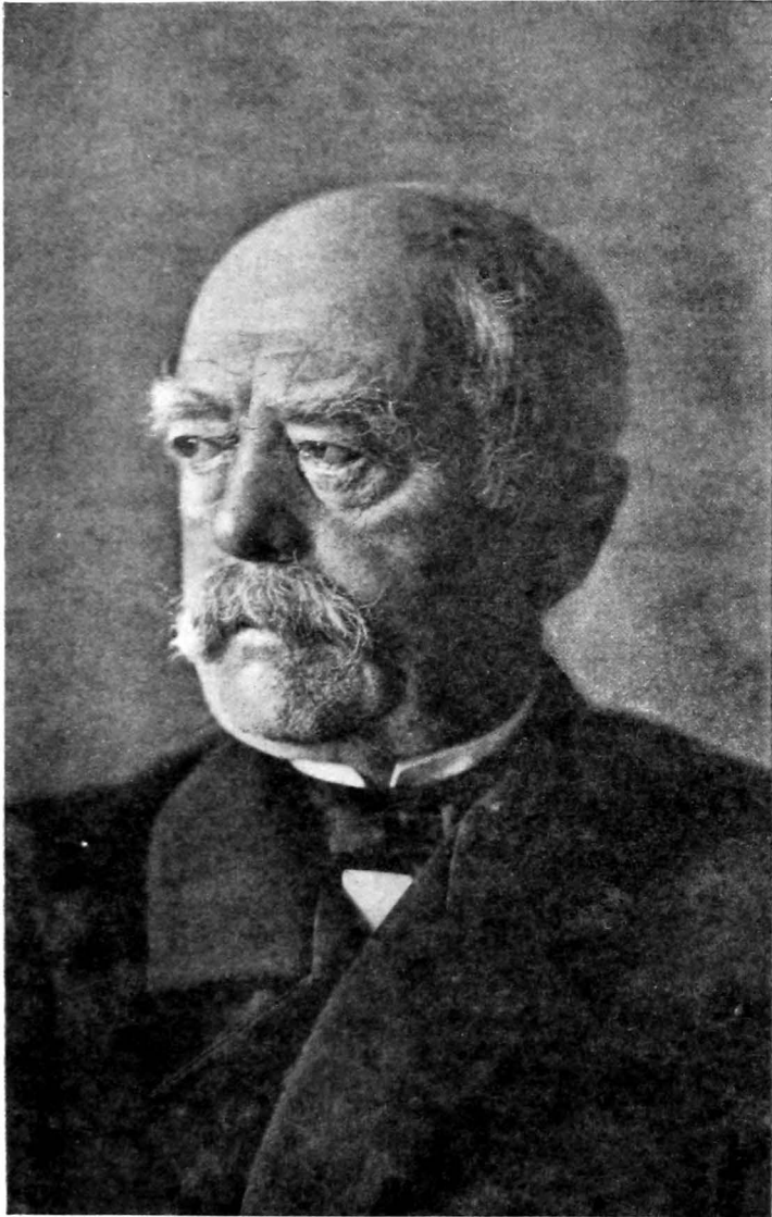
BISMARCK IN 1890