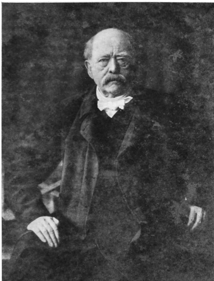
BISMARCK IN 1895