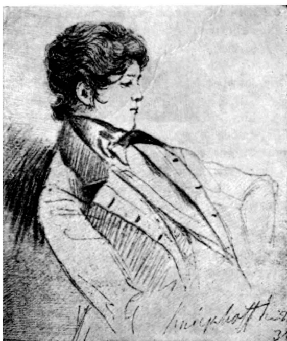
BISMARCK IN 1834