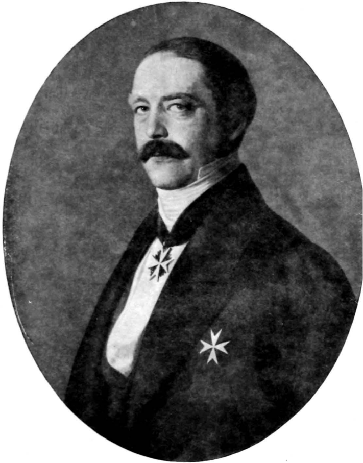
BISMARCK IN 1855