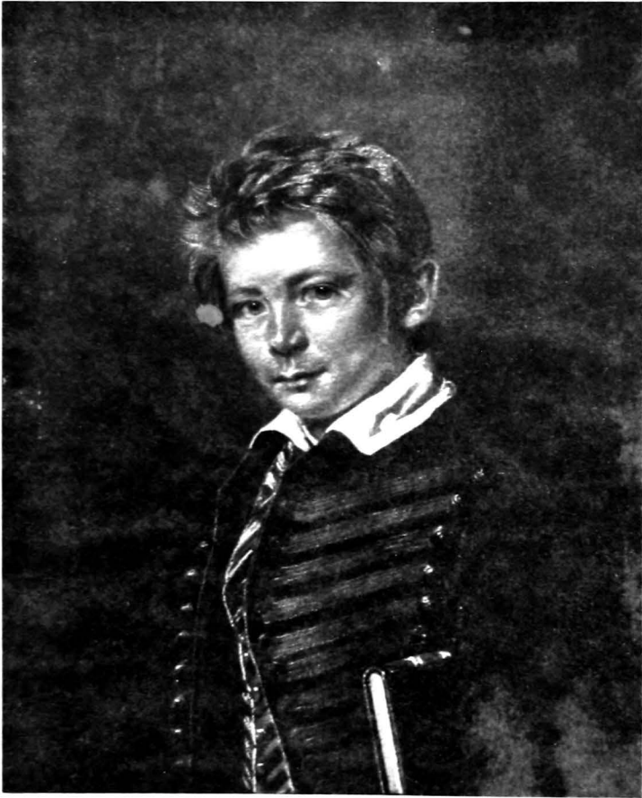
BISMARCK IN 1826