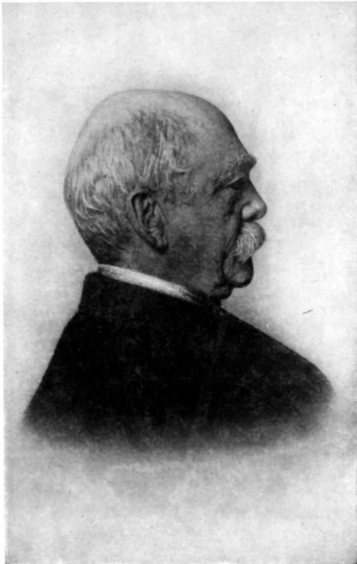
BISMARCK IN 1885