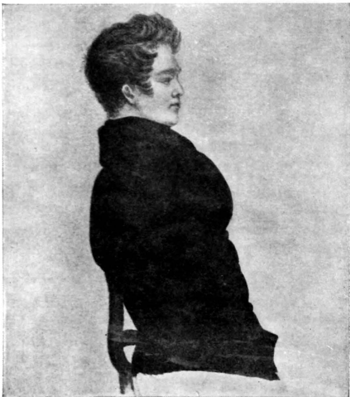
BISMARCK IN 1835