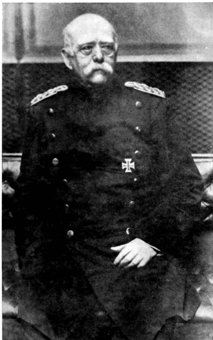
BISMARCK IN 1889