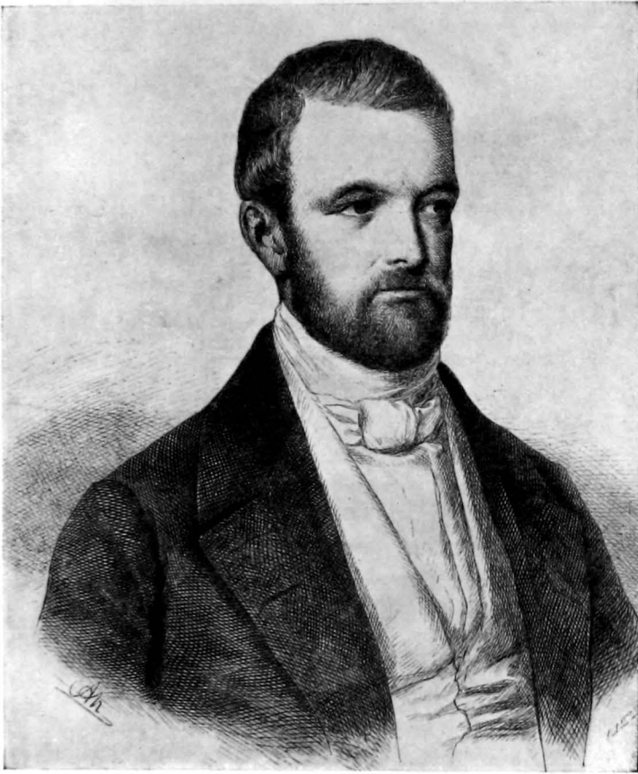
BISMARCK IN 1847