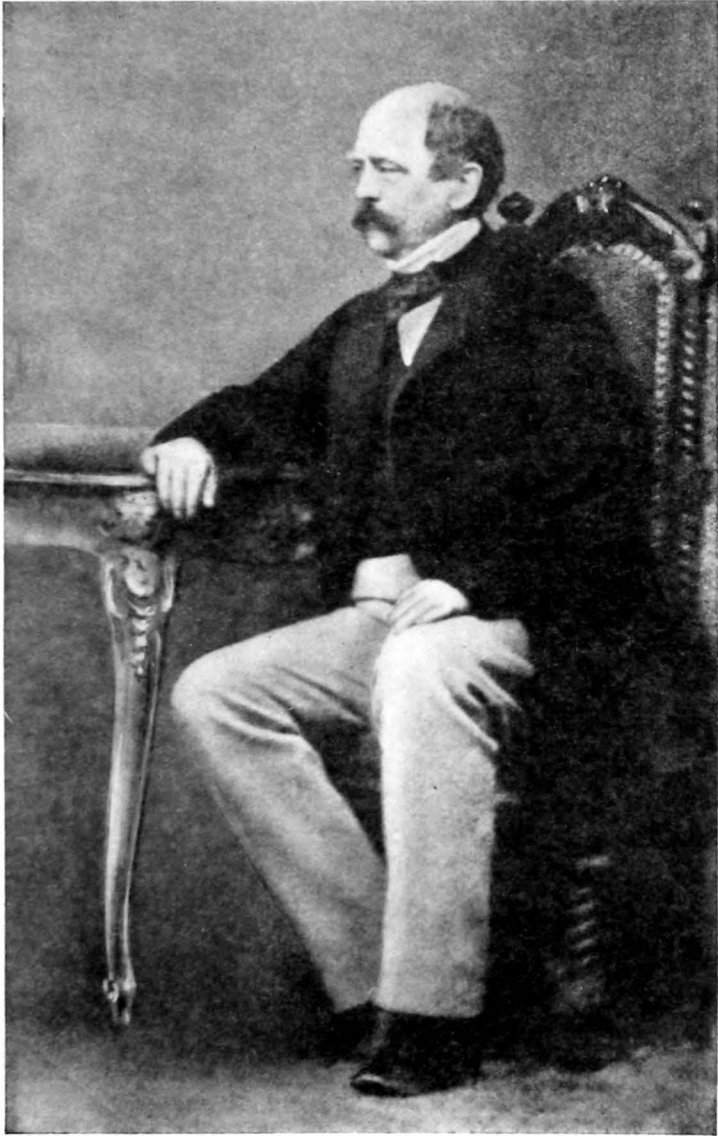
BISMARCK IN 1865