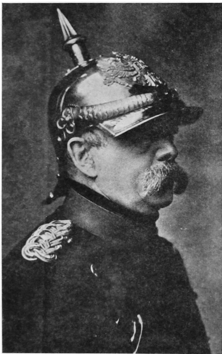
BISMARCK IN 1871