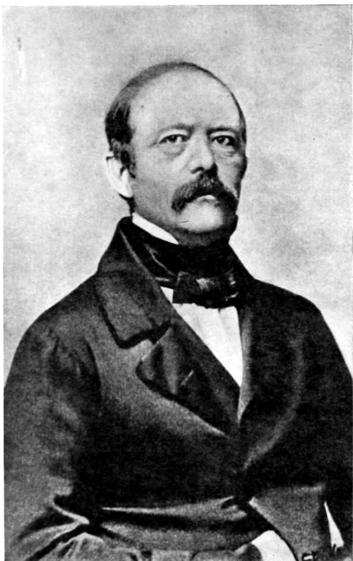
BISMARCK IN 1859