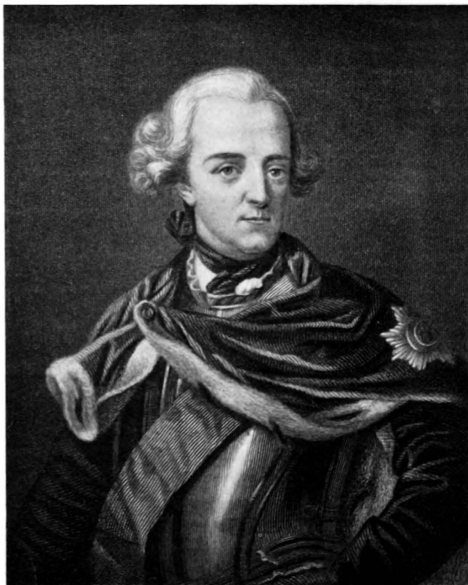
FREDERICK THE GREAT. AFTER THE PAINTING BY CARLO VANLOO.