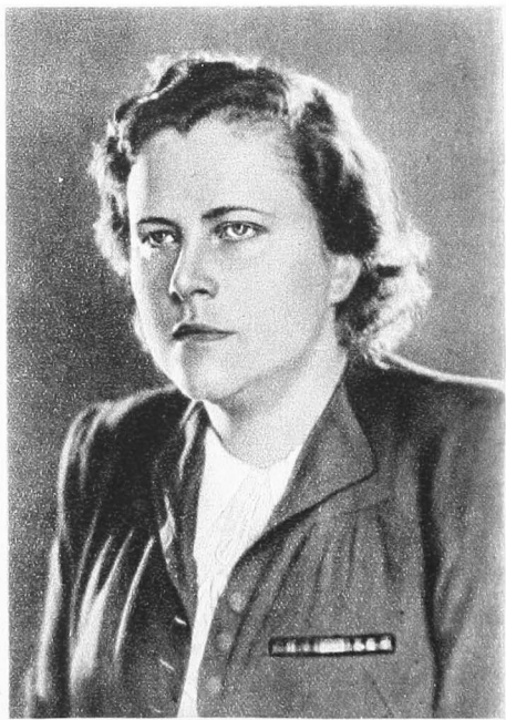
NINA VASILIEVNA POPOVA Secretary of the All-Union Central Council of Trade Unions and President of the Soviet Women's Anti-Fascist Committee