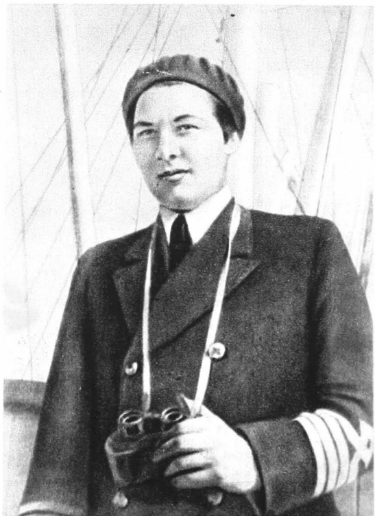
ANNA IVANOVNA SHCHETININA sea captain who has commanded Soviet ships since 1936