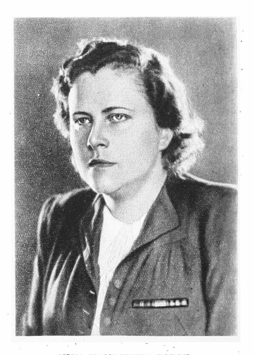
NINA VASILIEVNA POPOVA Secretary of the All-Union Central Council of Trade Unions and President of the Soviet Women's Anti-Fascist Committee