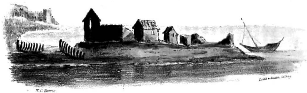
THE PORT NEAR LUCKPUT.