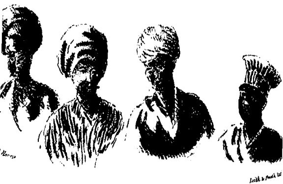
LOWANNAS OR HINDOOS OF SINDE.