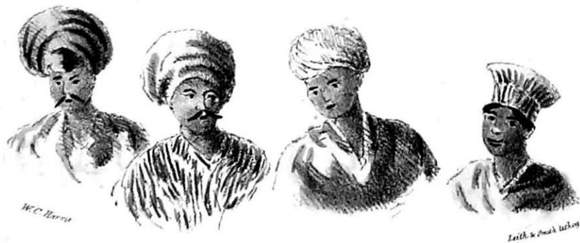
LOWANNAS OR HINDOOS OF SINDE.