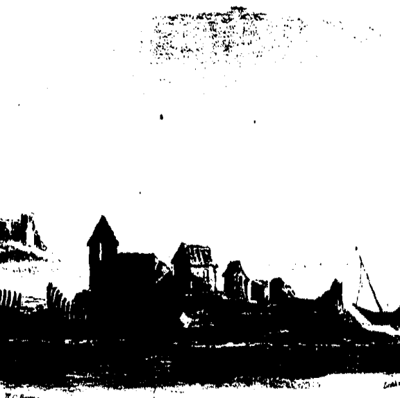
THE PORT NEAR LUCKPUT.