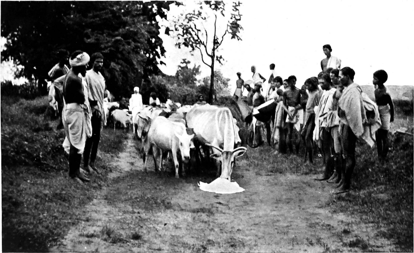
THE TRIAL OF LUCK DURING THE SOHRAE