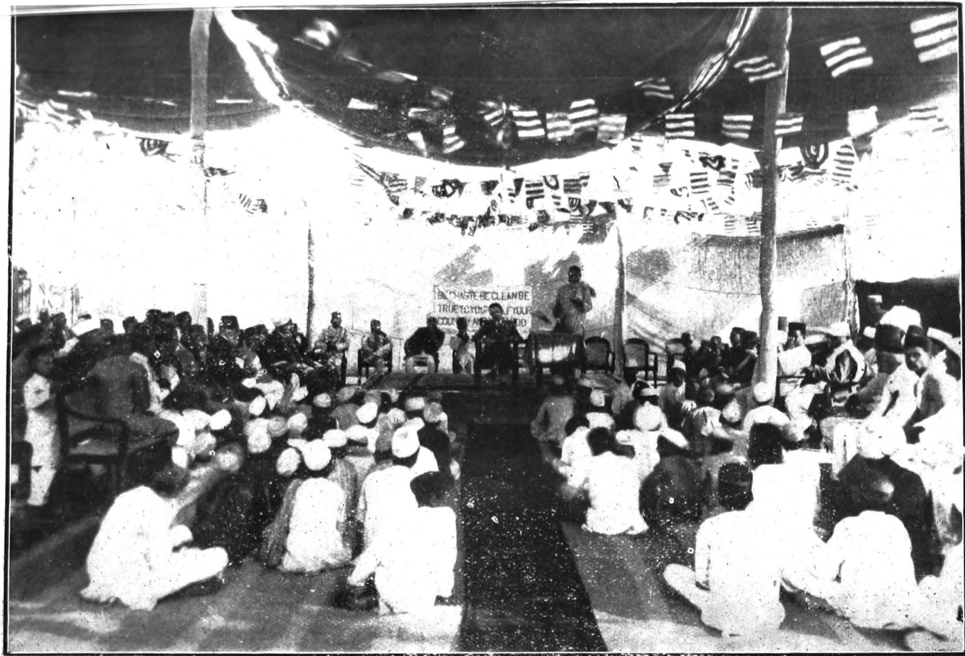
सभा के मन्त्री शिल्प विद्यालय खुरजा के उद्घाटन संस्कार के समय अपना भाषण पढ़ रहे हैं The Secretary reading his report. Opening ceremony Industrial School Khuria.