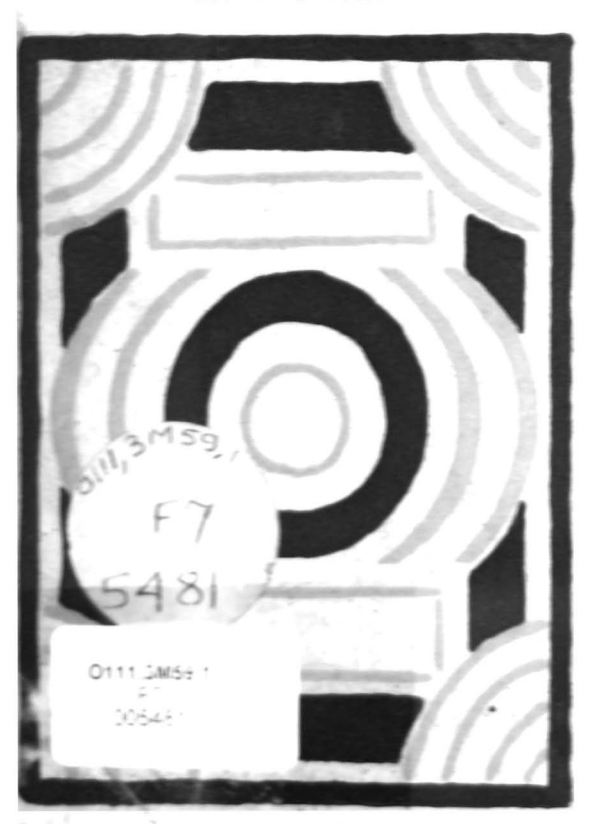
Lugarth stories. No. I