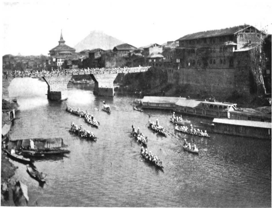
MISSION SCHOOLBOYS IN THEIR BOATS