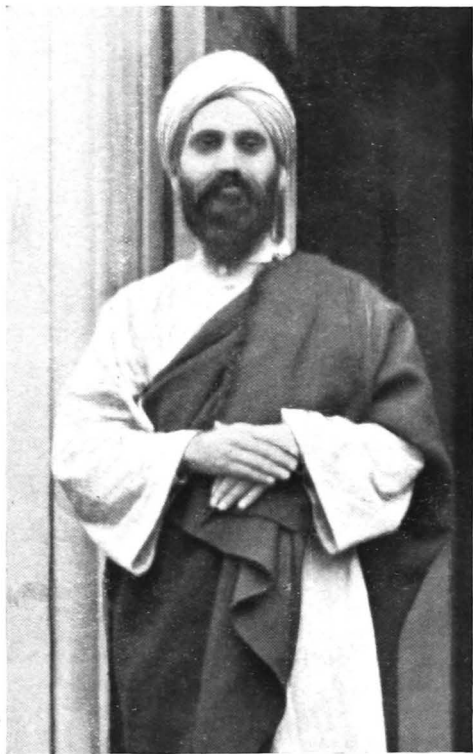
SADHU SUNDAR SINGH