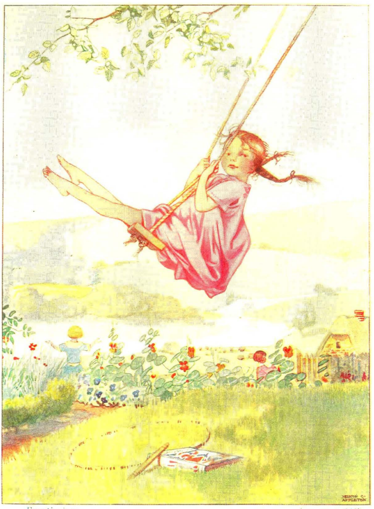
Frontispiece (see page 240).