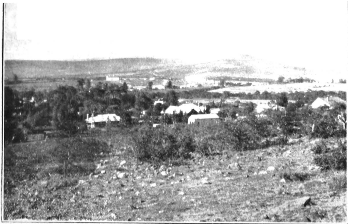
Fort Hare as seen from Alice.