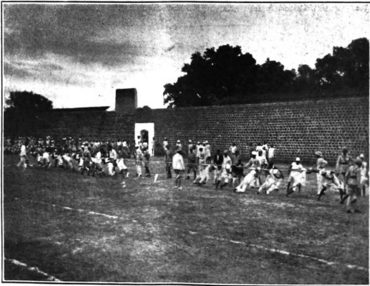
ANNUAL SPORTS OF PRISONERS, 1936 NAGPUR CENTRAL JAIL