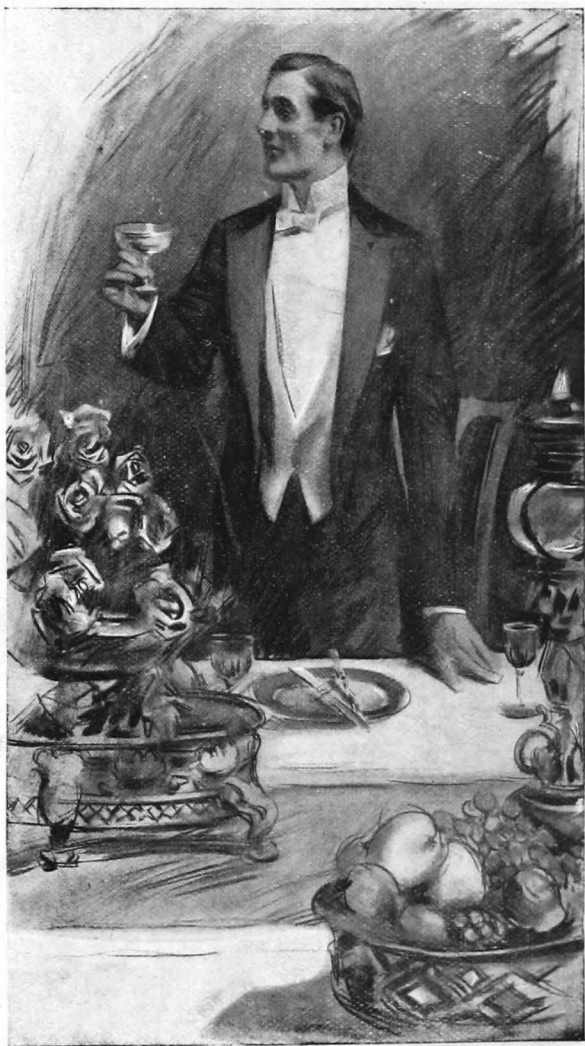
Speeches and Toasts.