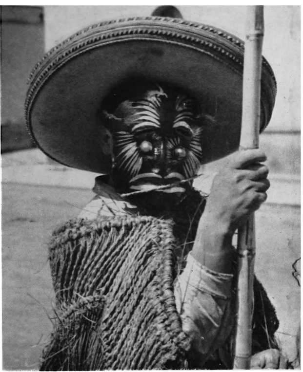
A Masked Dancer from Metepec