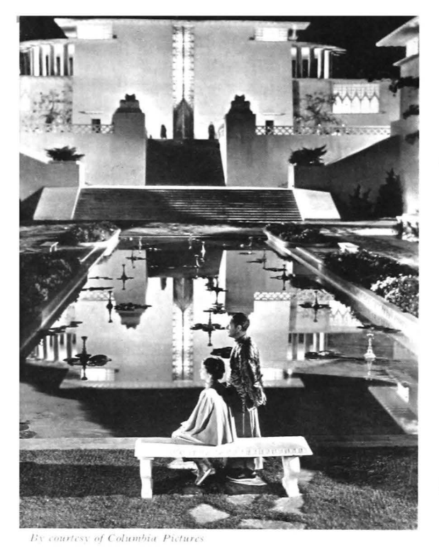
Hollywood imagines Utopia: a scene from Capra's 'Lost Horizon.'