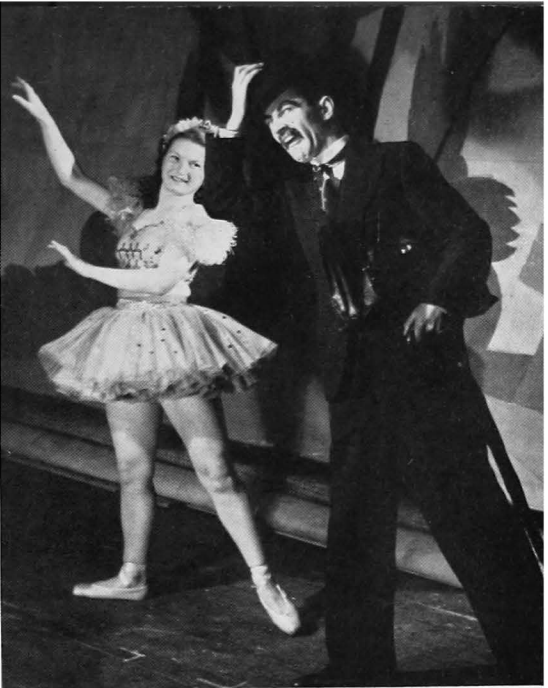
The Wicked Uncle: a scene from the Unity Theatre Christmas Pantomime.