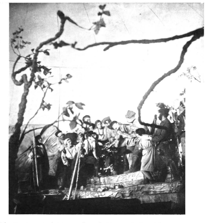
The Prostitutes in 'Aristocrats,' at the Moscow Realistic Theatre.