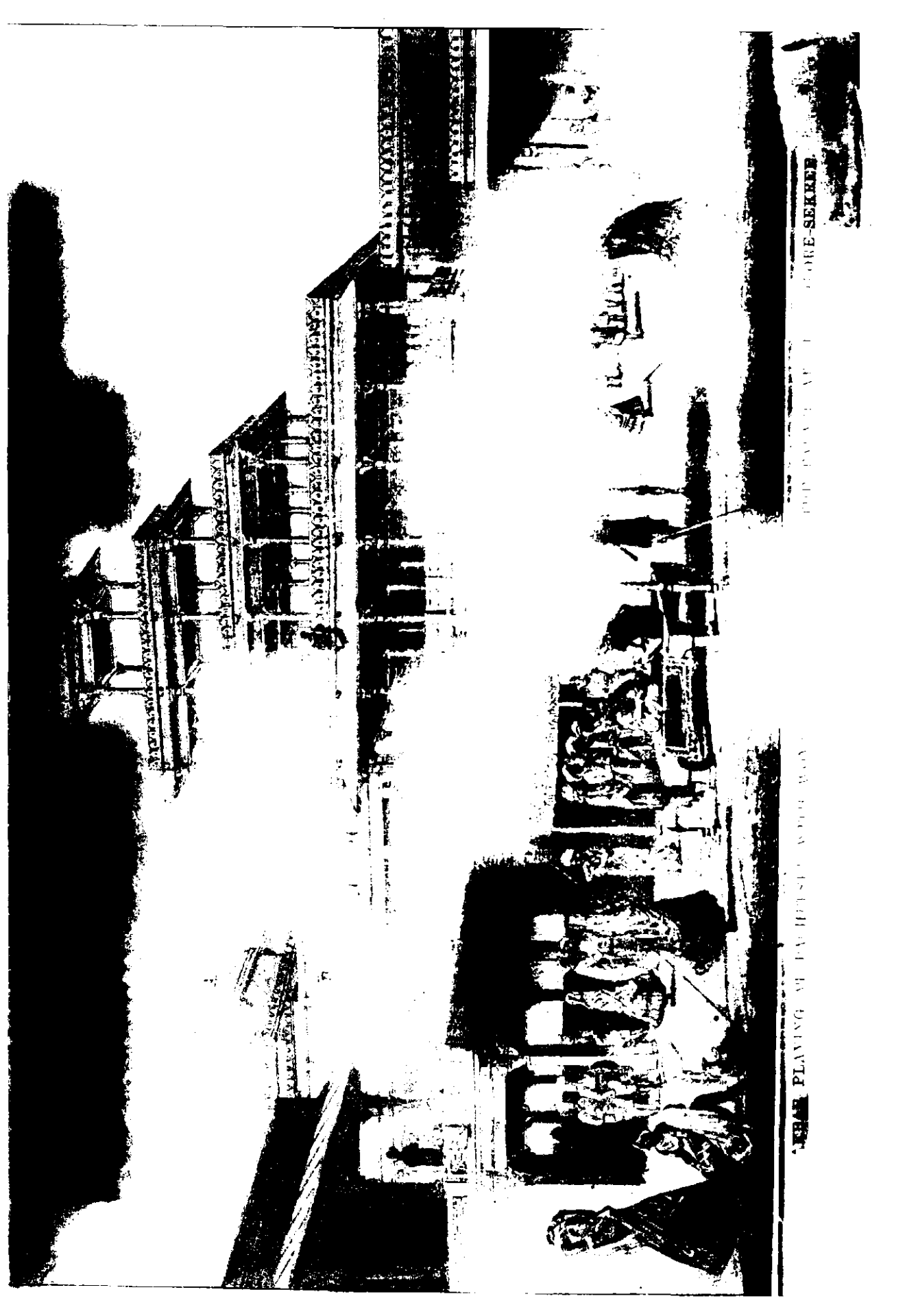
THE PLAYERS AT THE BOARD GAME