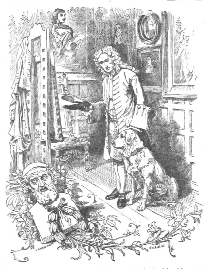
which his song and life celebrated ; duteously bringing his old parent to live and die there, entertaining his friends there, and making

enthusiastic national admiration which justly rewarded his great achievement of the "Iliad," purchased that famous villa of Twickenham