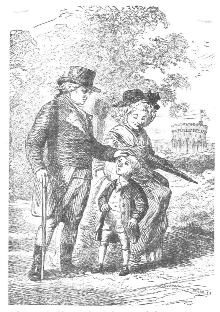
and bragged with absurd vainglory; we dealt to our enemy a monstrous injustice of contempt and scorn; we fought him with all