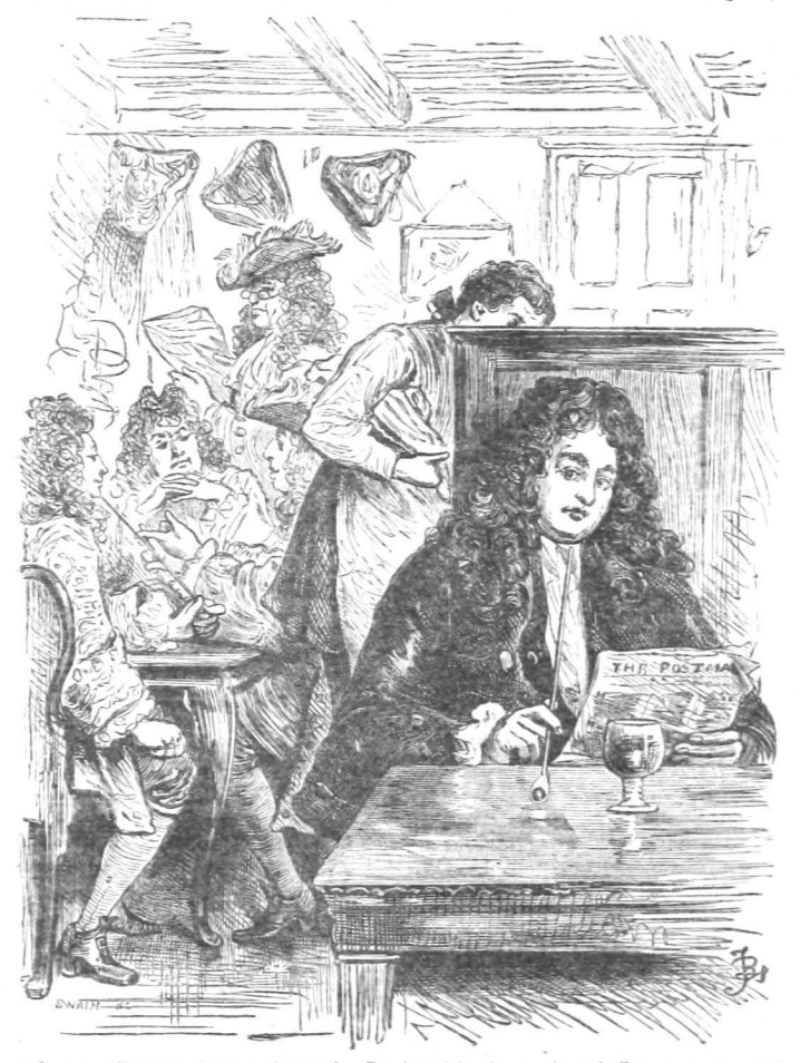
wherever I see a cluster of people, I mix with them, though I never open my lips but in my own club. ["Thus

will and kindness for every single man and woman in it—having need of some habit and custom binding him to some few; never doing any