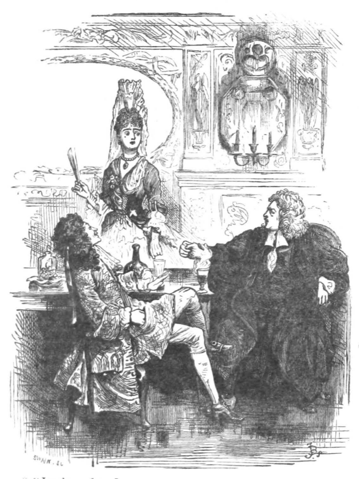
" "I make no figure but at court, where I affect to turn from a lord to the meanest of my acquaintances."—Journal to Stella.

matter. And so the reputation of wit and great learning does the office of a blue riband or a coach and \sin x "*