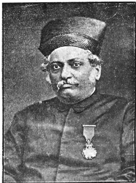
SORABJI SHAPURJI BENGALI