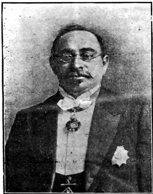
SIR M. BHOWNAGGREE.