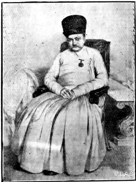
SIR JAMSETJEE JEJEEBHOY