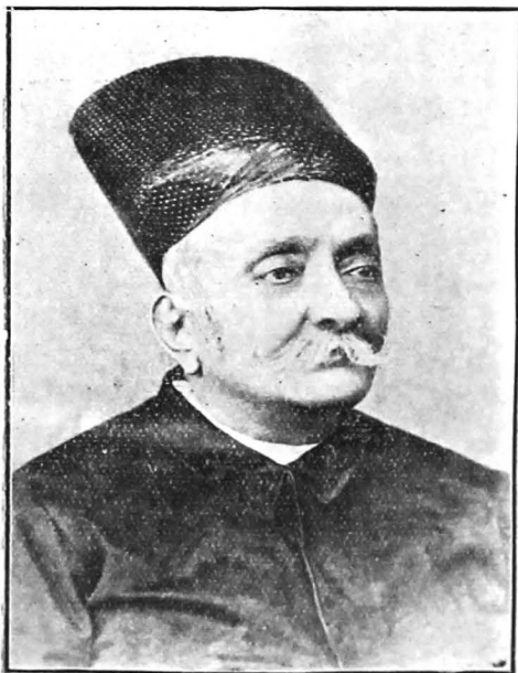
SIR DINSHAW MANOCKJEE PETIT