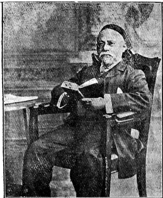
BEHRAMJI M. MALABARI