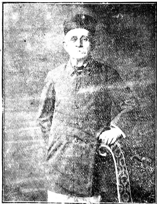
SIR DINSHAW WACHA (As he appears to-day.)