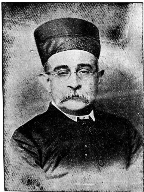
SIR DINSHAW EDULJI WACHA (An earlier portrait.)