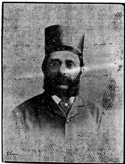
SIR PHEROZESHAH MEHTA