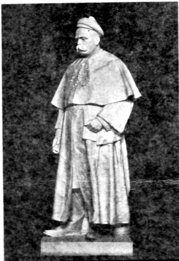
RĀNADE'S STATUE IN BOMBAY