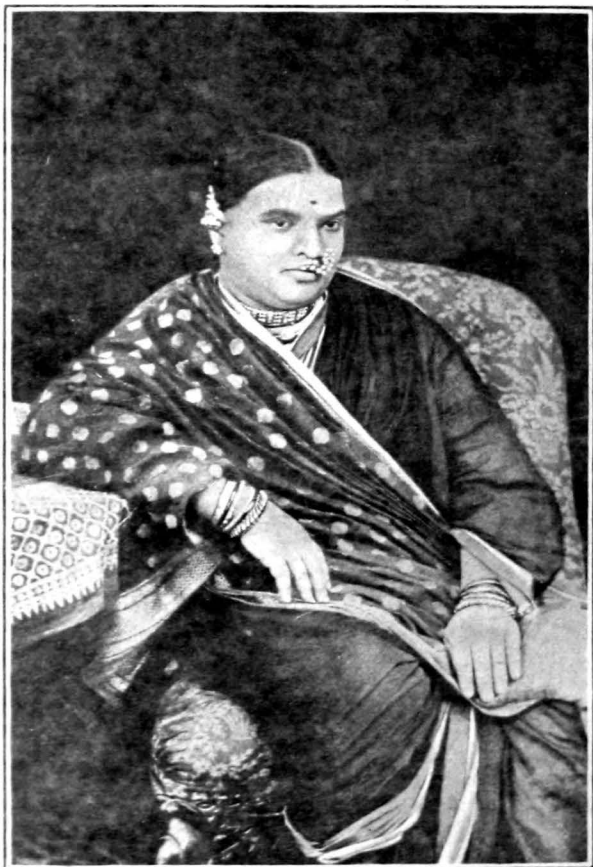
MRS. RAMĀBĀĪ RĀNADE