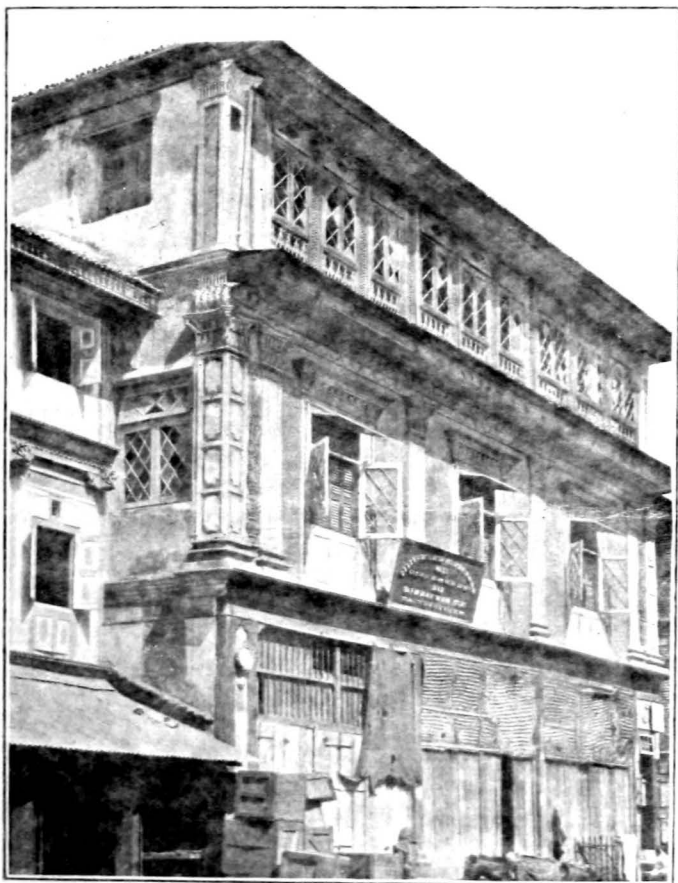
THE SĀRVAJANIK SABHĀ BUILDING AT POONA