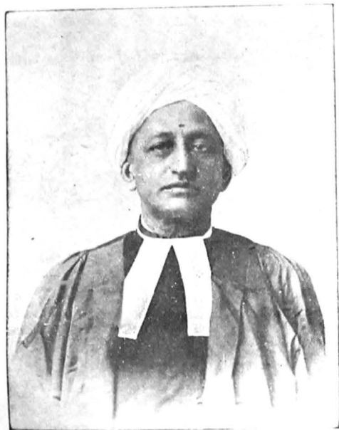
DR. SIR S. SUBRAMANIA IYER. (As Indian.)