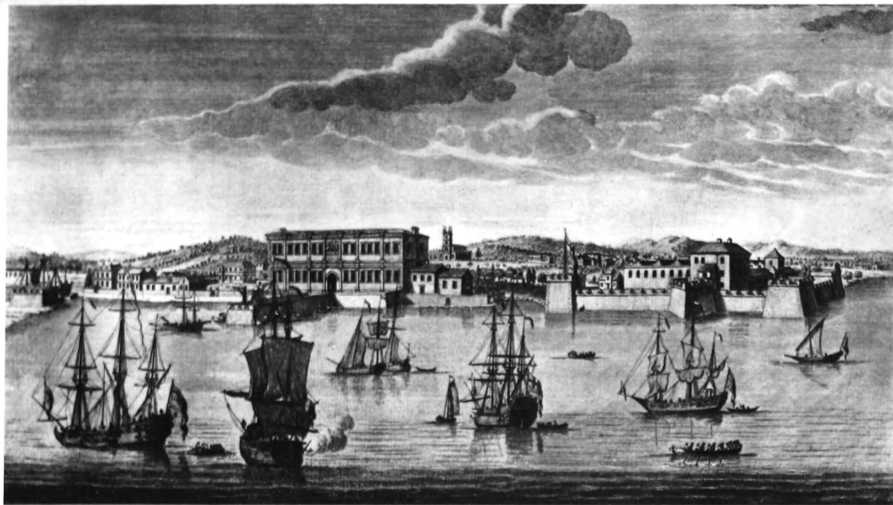
THE HARBOUR AND FORT OF OLD BOMBAY.