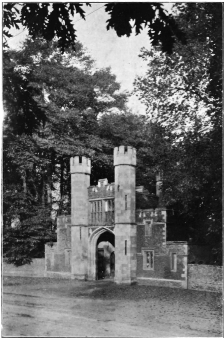
GATEWAY, HILLINGTON HALL.