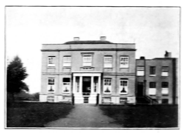
STAPLETON GROVE, BRISTOL (Now Beech House)