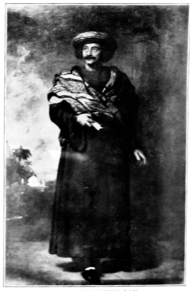
RAJA RAM MOHUN ROY