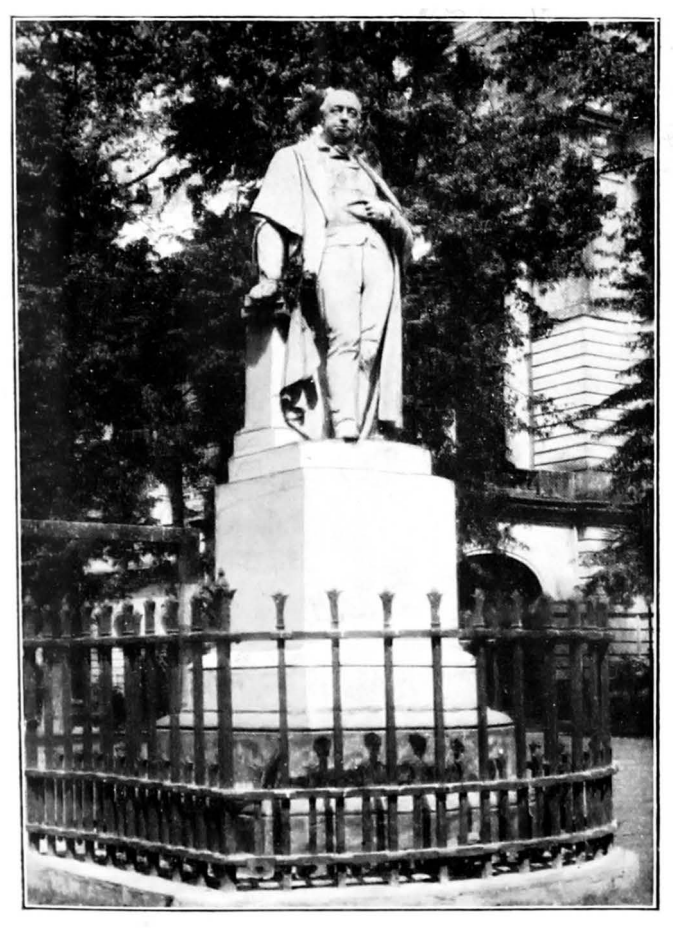
DAVID HARE A Statue in College Street, Calcutta.