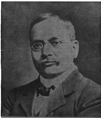
G. K. GOKHALE in England in 1897.