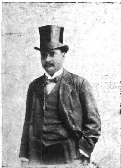
The Hon'ble Mr. G. K. Gokhale, C. I. E. Born 9-5-1866. Died 19-2-1915.