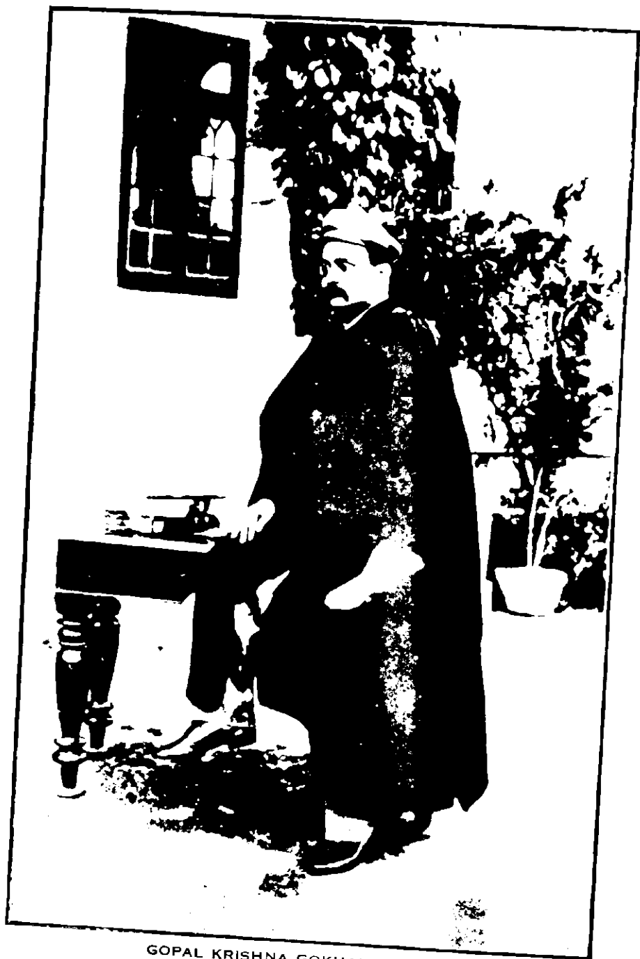
GOPAL KRISHNA GOKHALE, C.I.E.