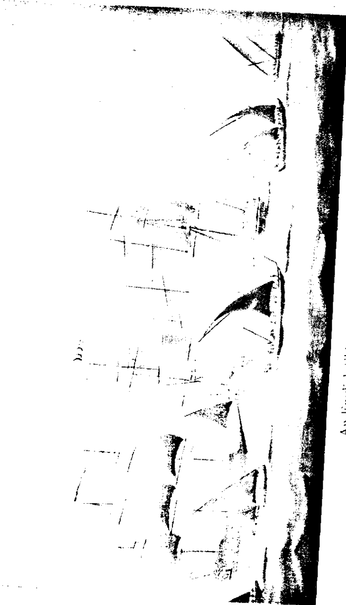
An English Ship attacked by the Marathas