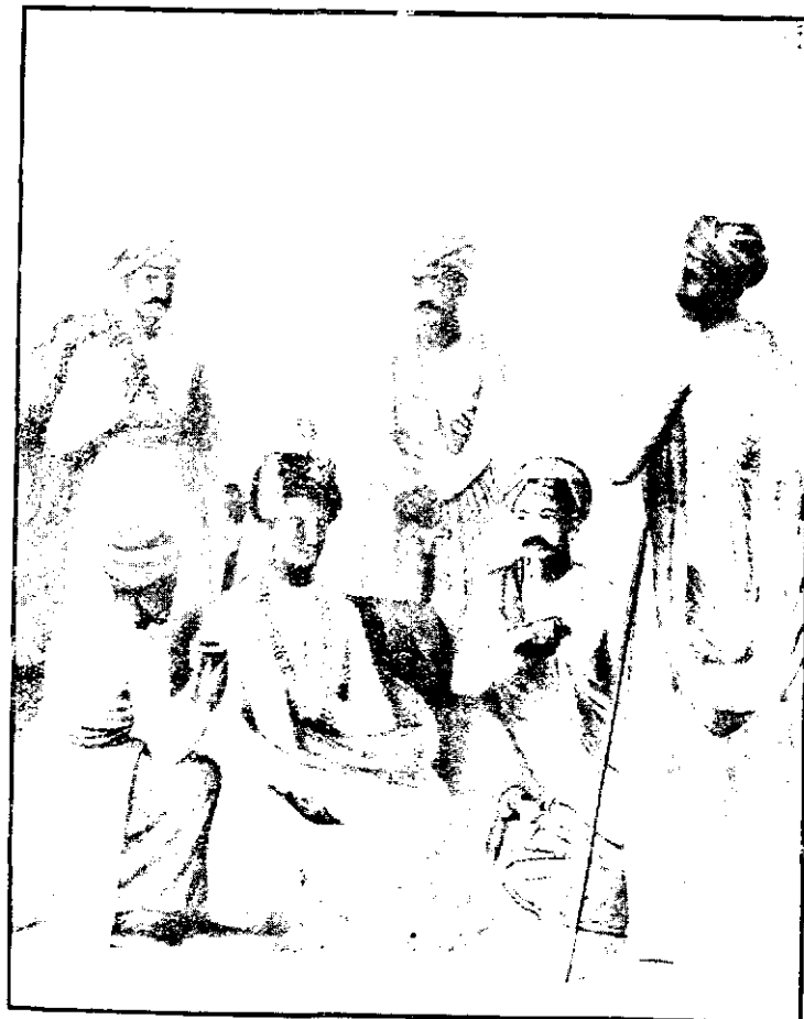
Peshwa Madhav Rao II and his Ministers