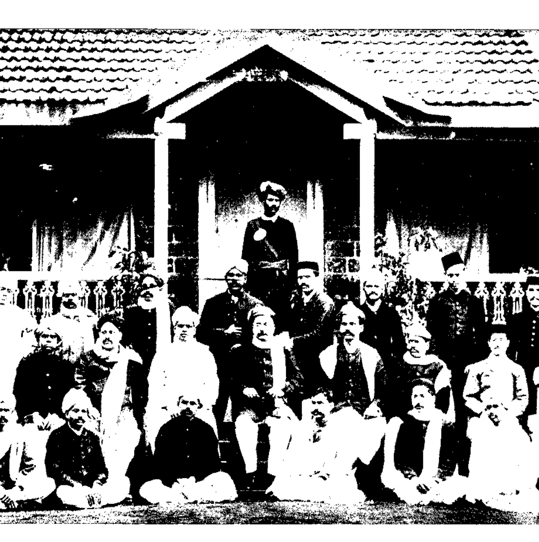
Sastri as a member of the Servants of India Society — 1908. Sastri is seated on Gokhale's right.