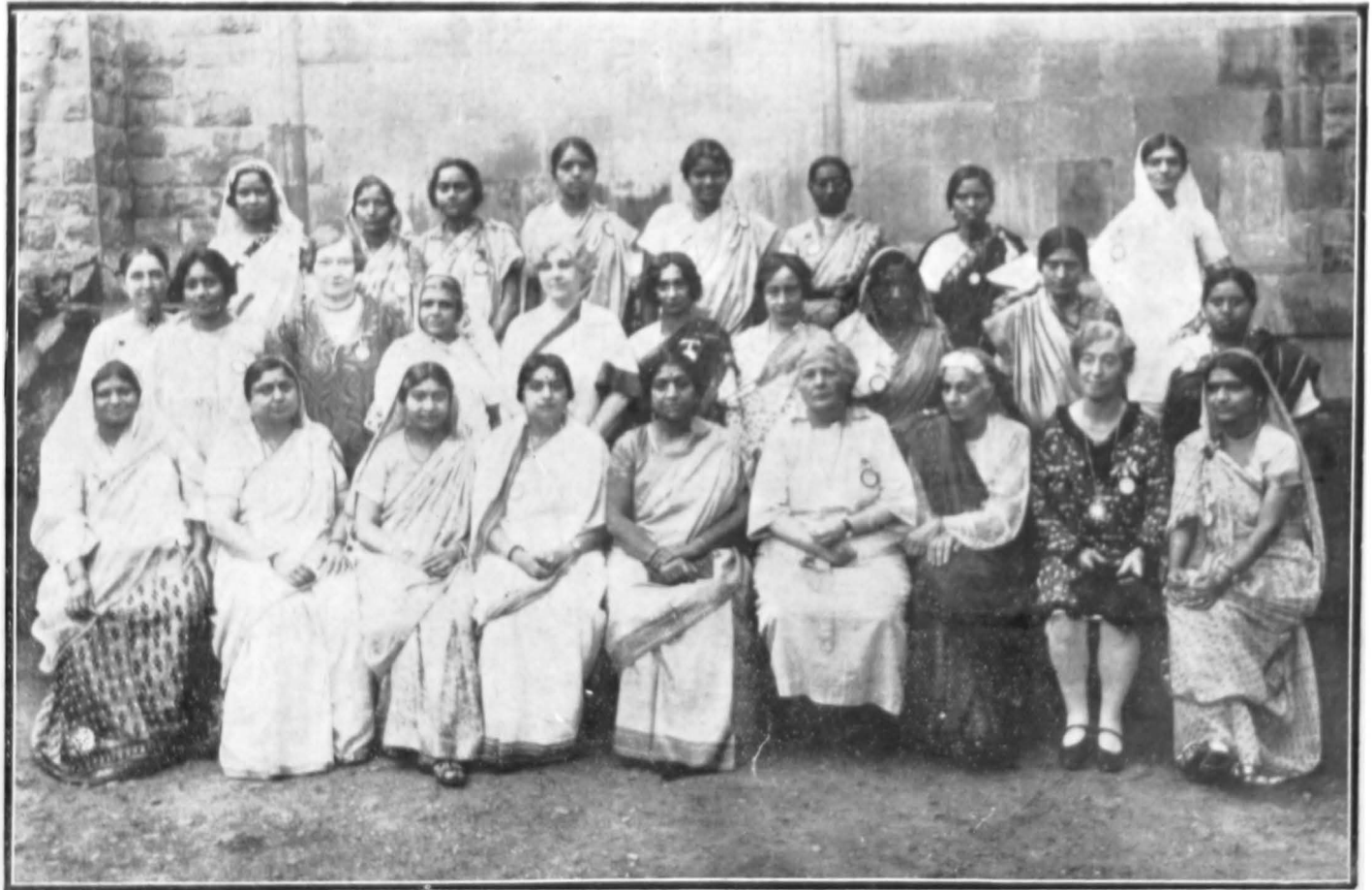
MEMBERS OF THE STANDING COMMITTEE 1929.