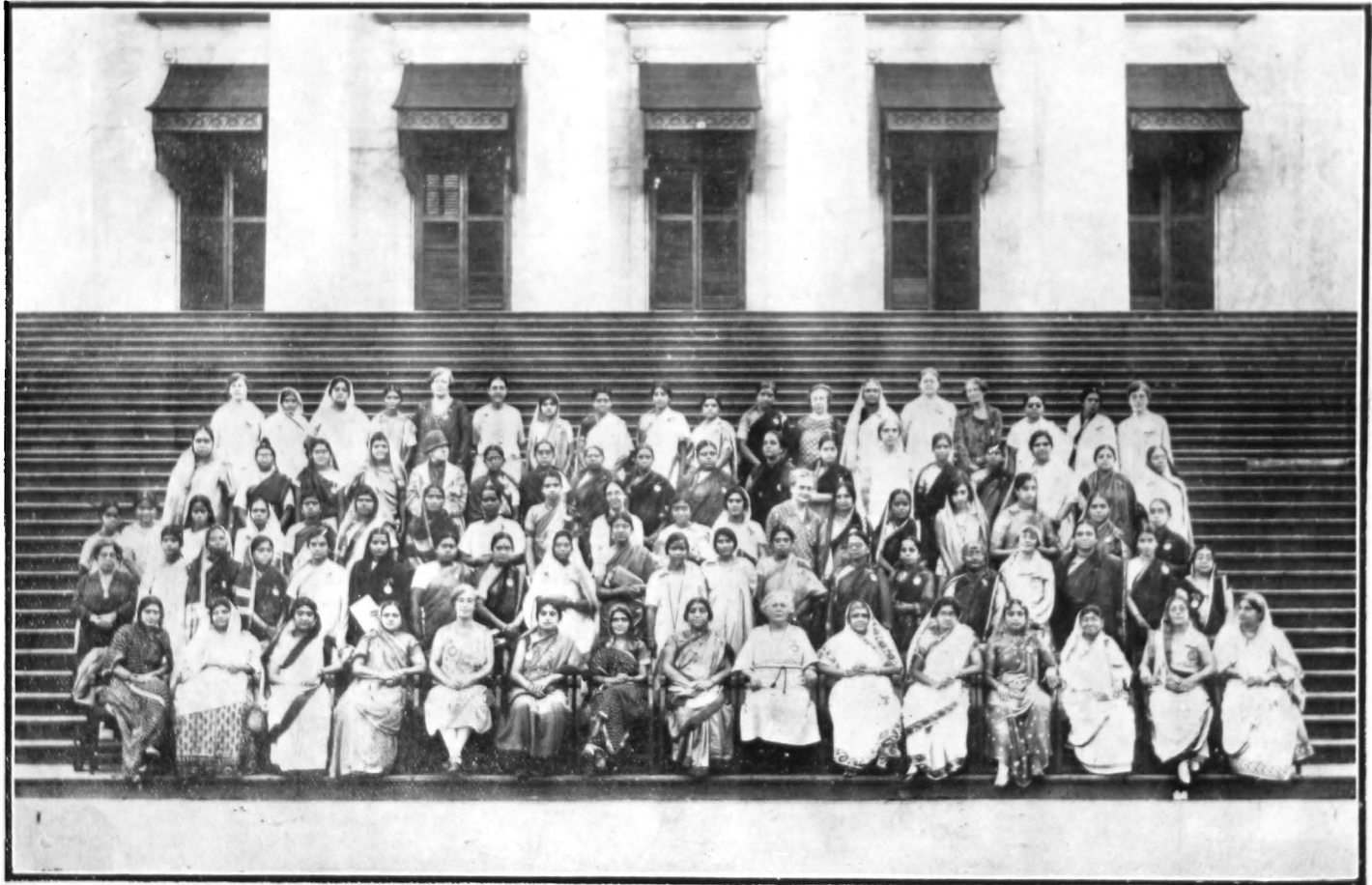
DELEGATES TO THE 4TH SESSION OF THE ALL-INDIA WOMEN'S CONFERENCE.