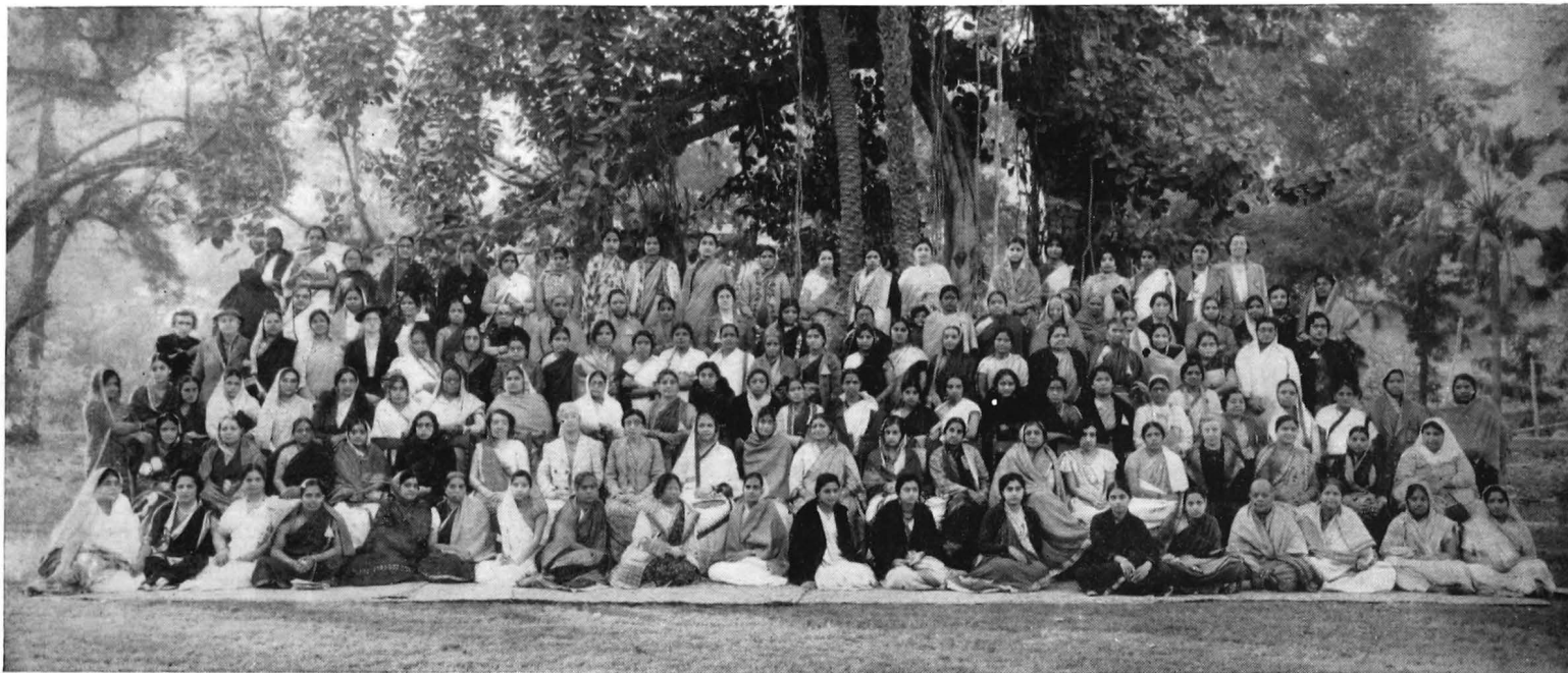
Delegates to the Thirteenth Session, 1938