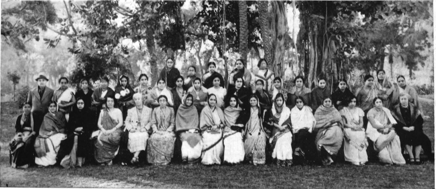
Members of the Standing Committee, 1938.