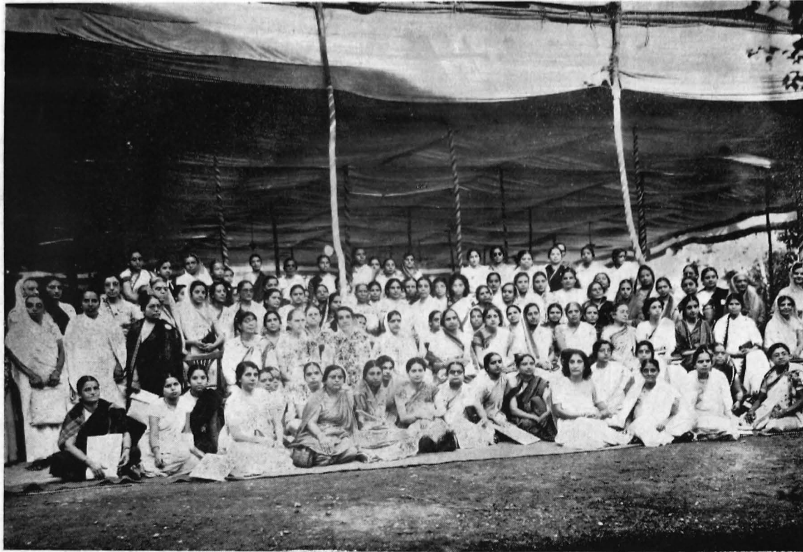
Delegates to the XVII Session of the All-India Women's Conference, Bombay.