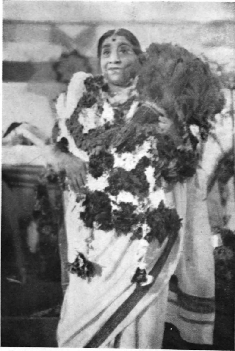
Shrimati SAROJINI NAIDU, Patron, A.-I. W. C.