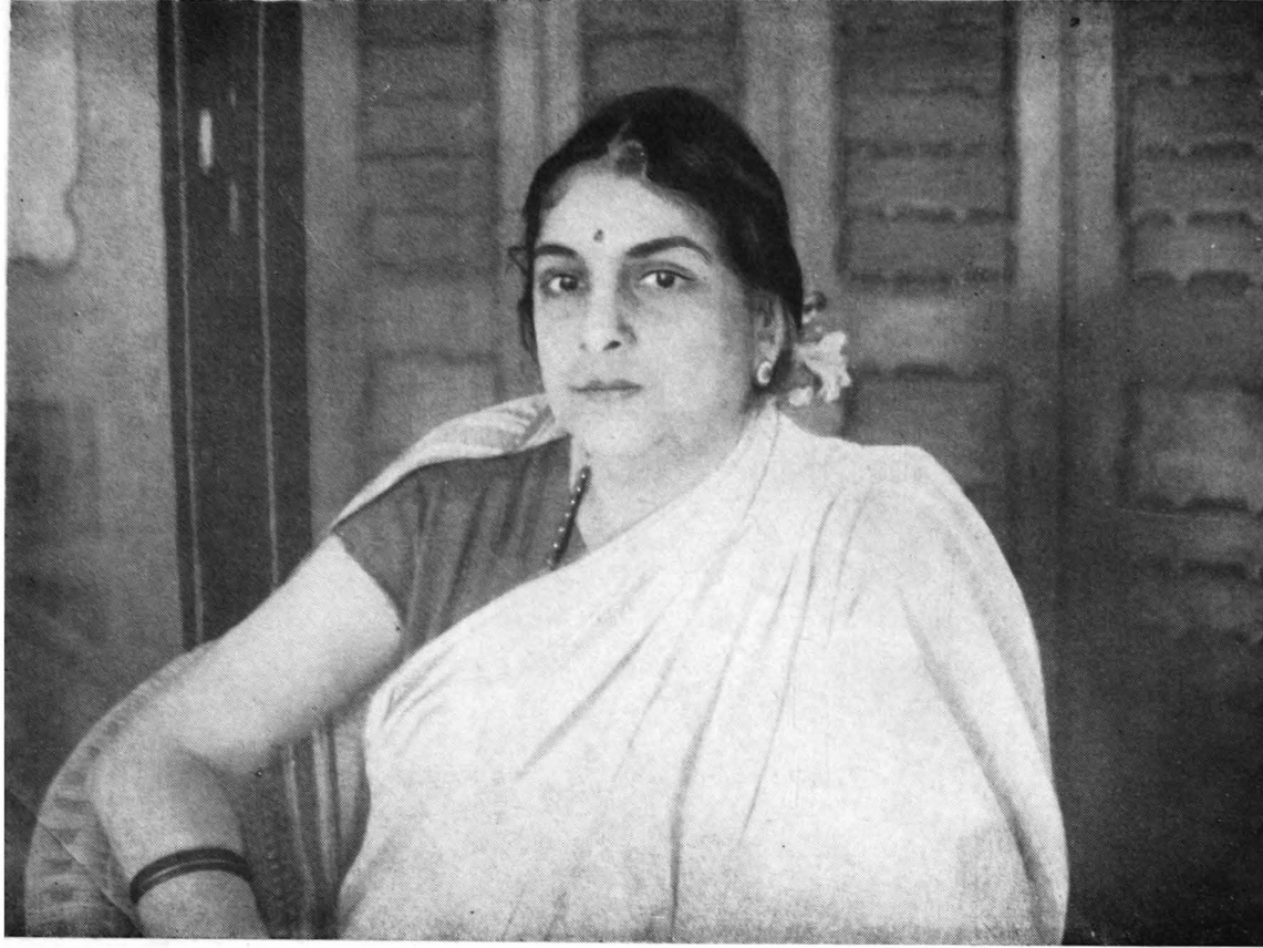
Shrimati KAMALADEVI. President, All-India Women's Conference, Bombay, 1944.