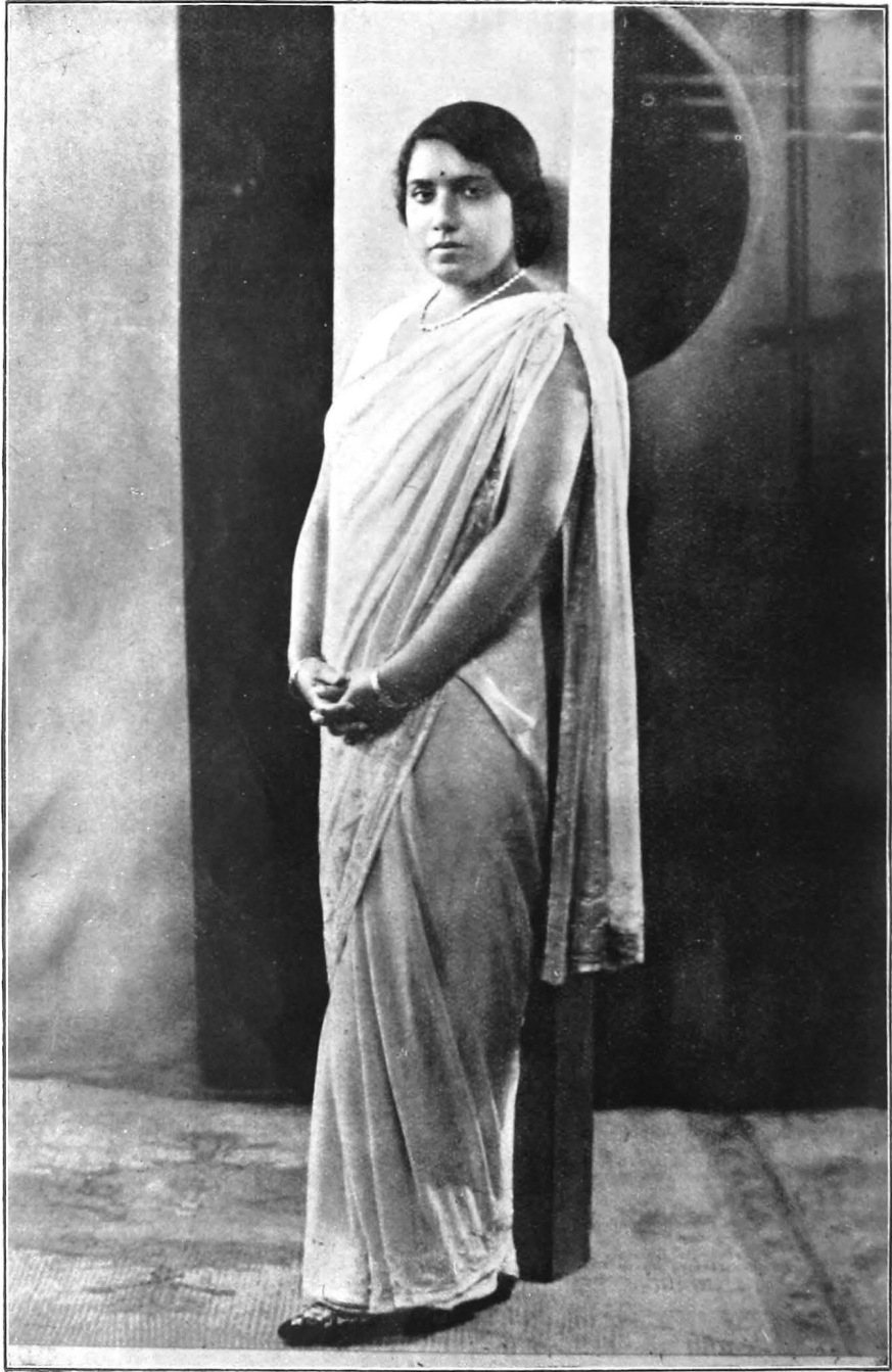
H. H. MAHARANI SETU PARVATI BAYI OF TRAVANCORE. President, All-India Women's Conference, 1935-36