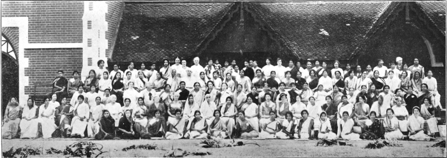
DELEGATES TO THE TENTH SESSION, 1935