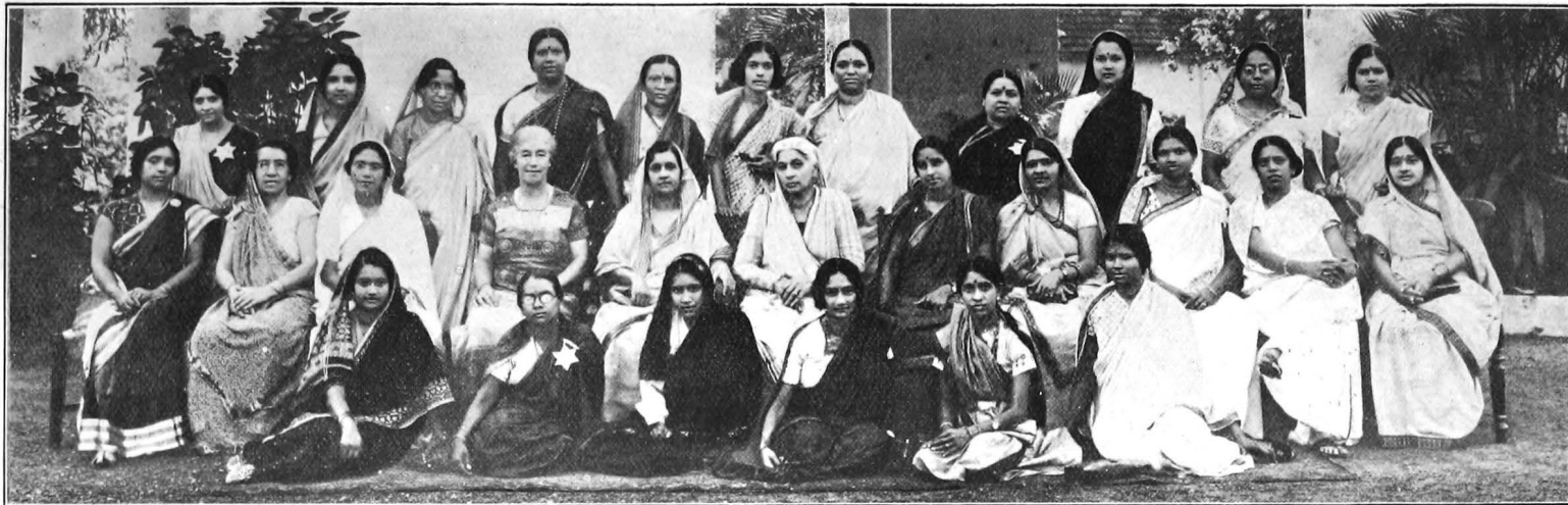
MEMBERS OF THE STANDING COMMITTEE, 1935