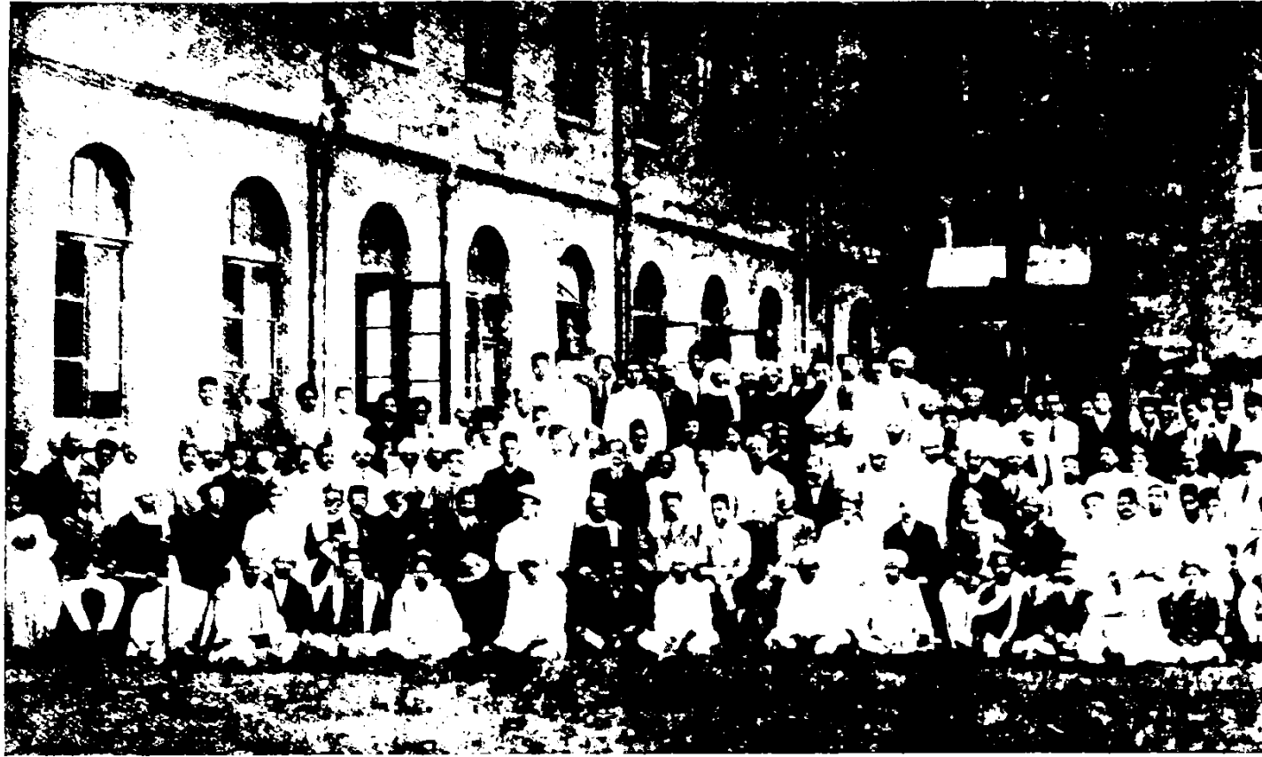
Group of Delegates.