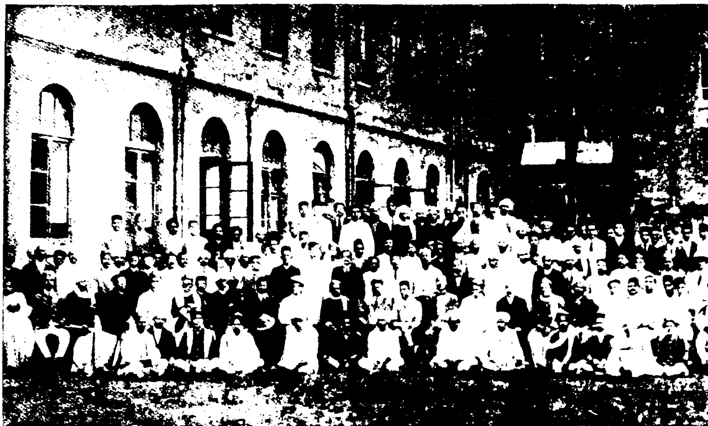
Group of Delegates.