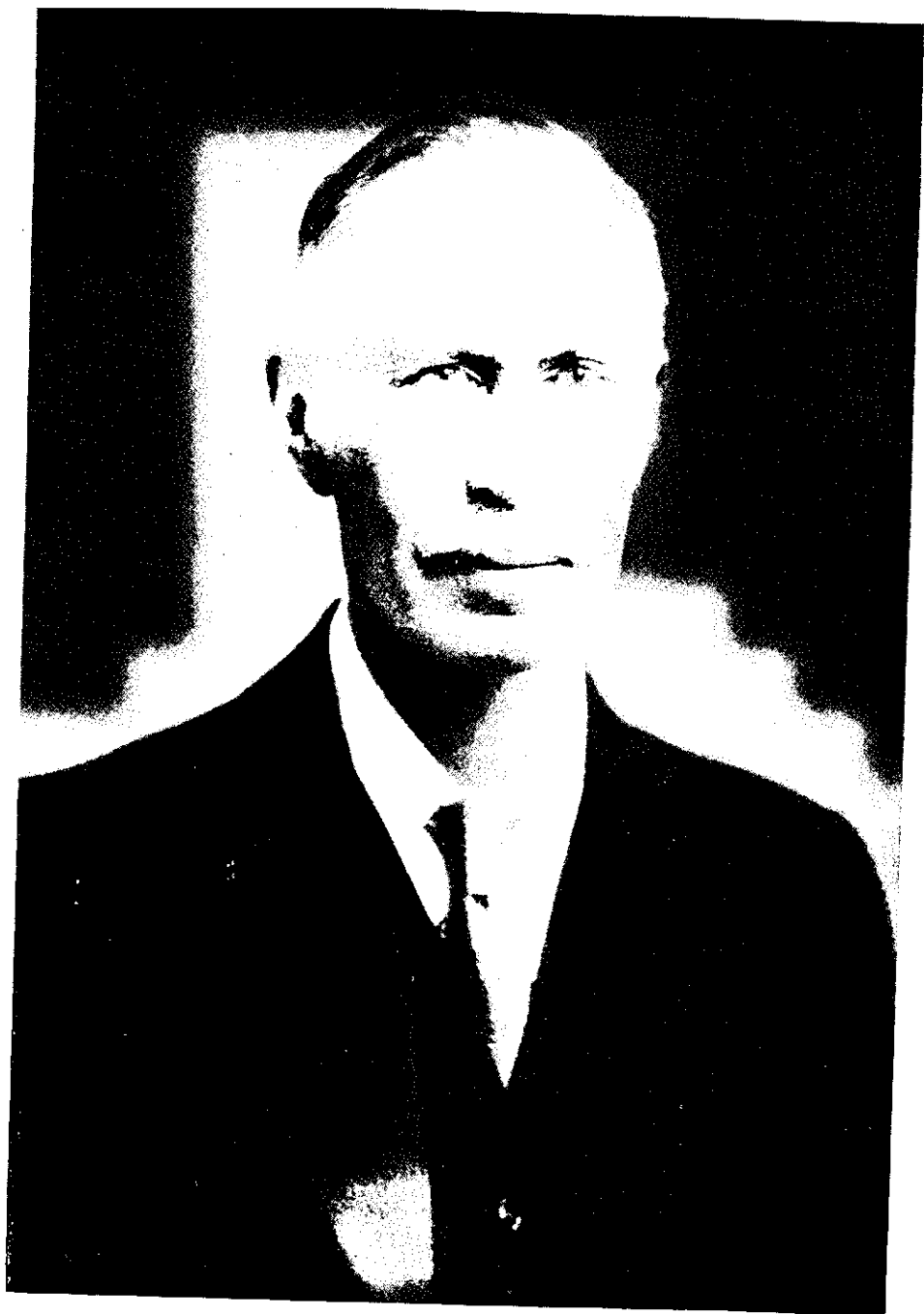
SIR HENRY BRACKENBURY