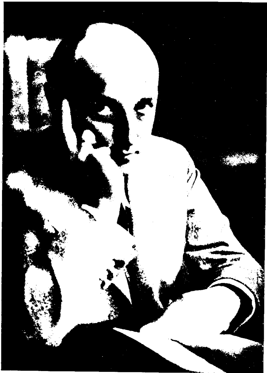
PROFESSOR K. MANNHEIM