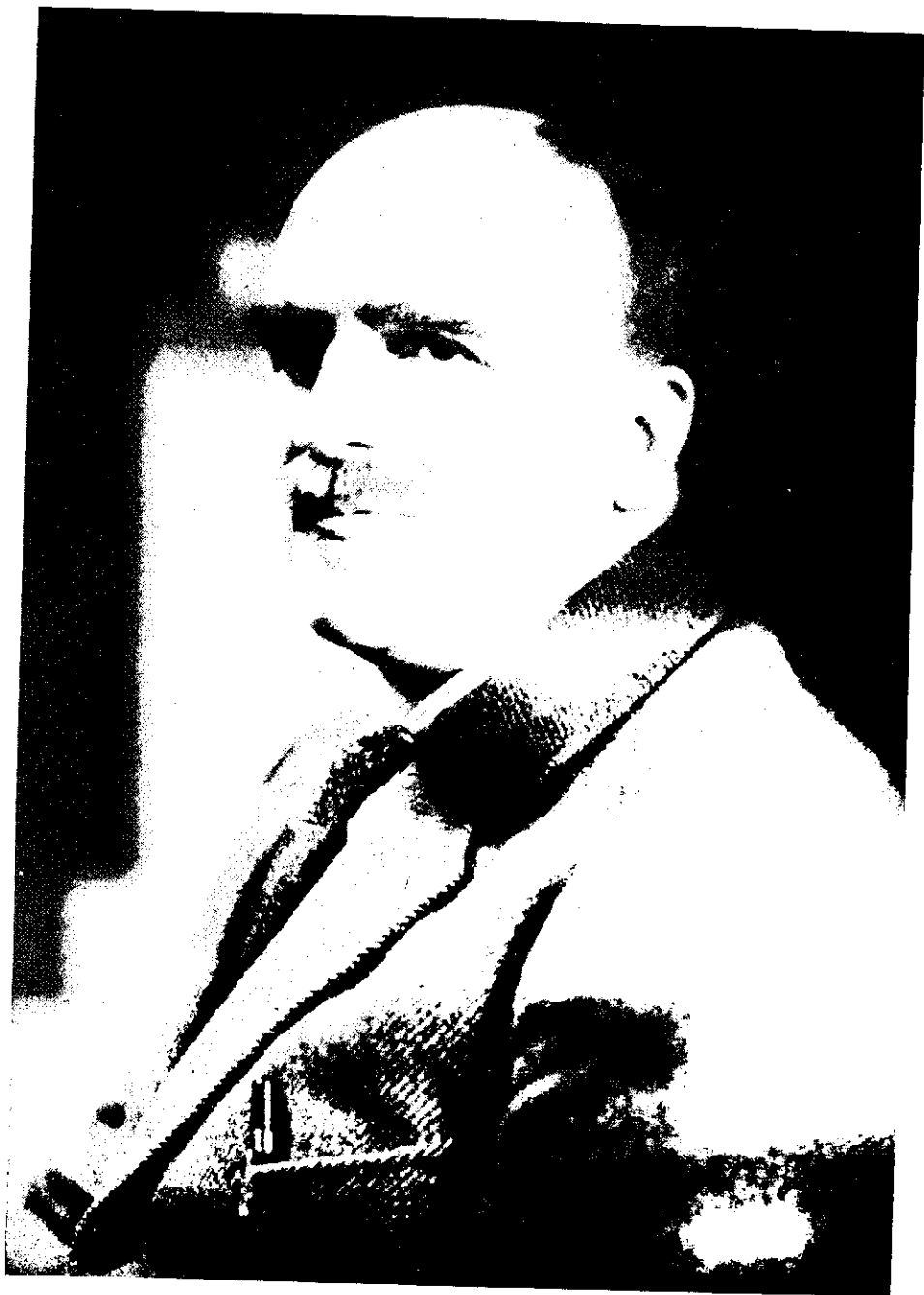
PROFESSOR J. B. S. HALDANE