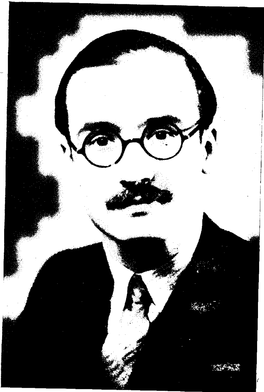
THE EARL OF LISTOWEL