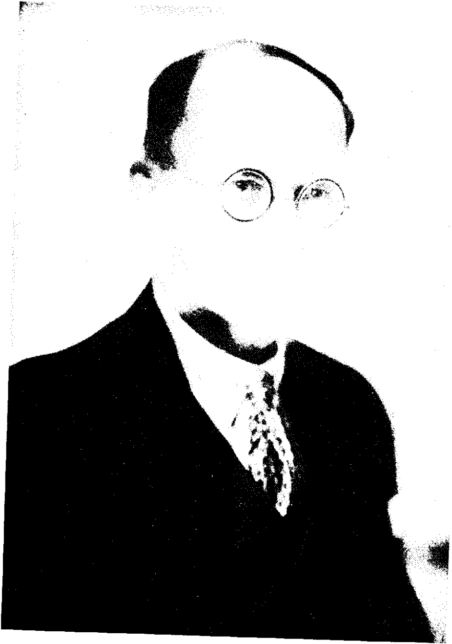
PROFESSOR B. MALINOWSKI