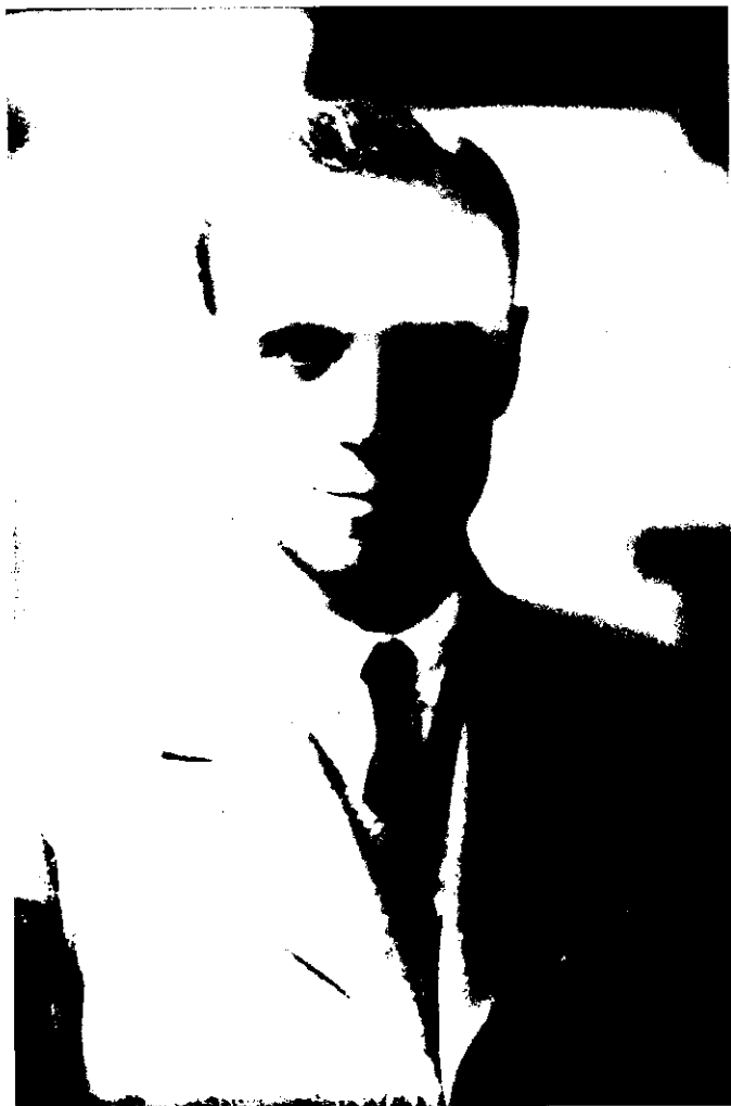
DR. R. B. CATTELL