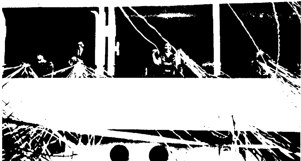
Leaving Yokohama on the S.S. Chichibu Maru for my lecture tour in the United States, October 13, 1932