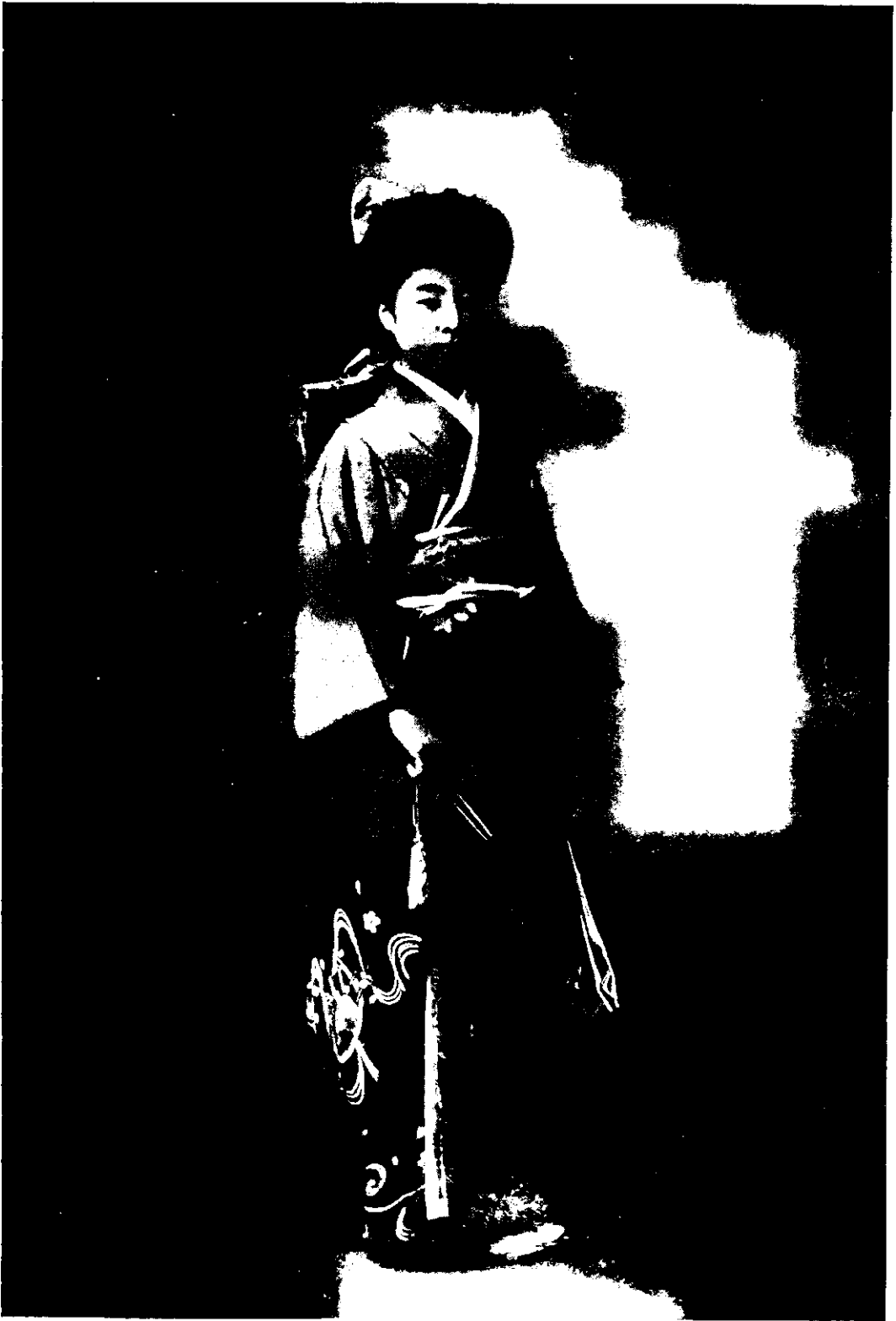
Myself at the age of fifteen, in full Japanese costume