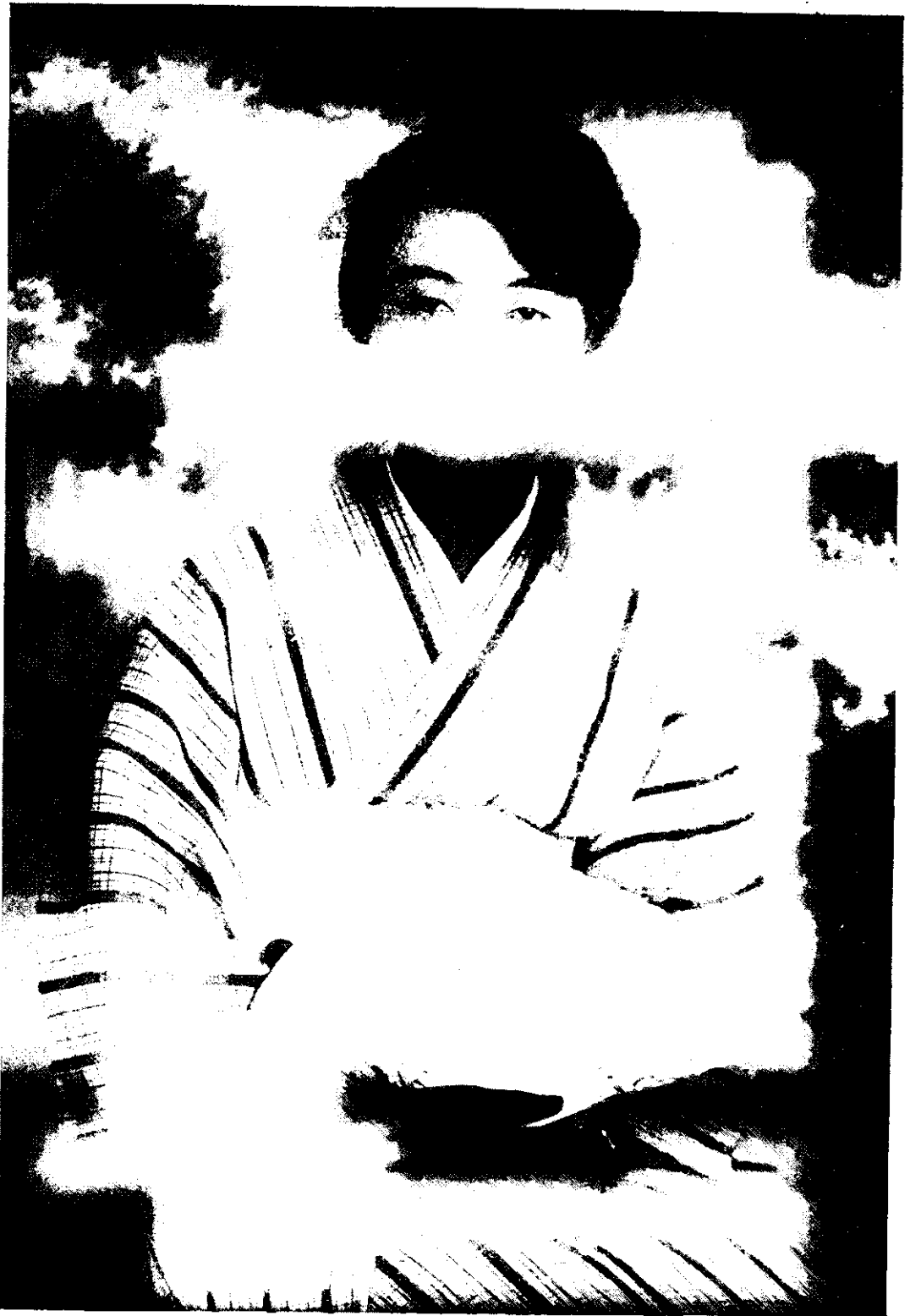
Returning to my work in Japan