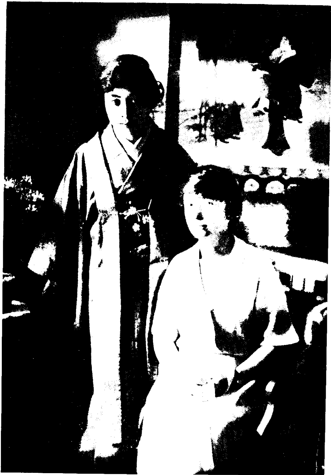
Mrs. Margaret Sanger and myself at the time of her visit in 1922