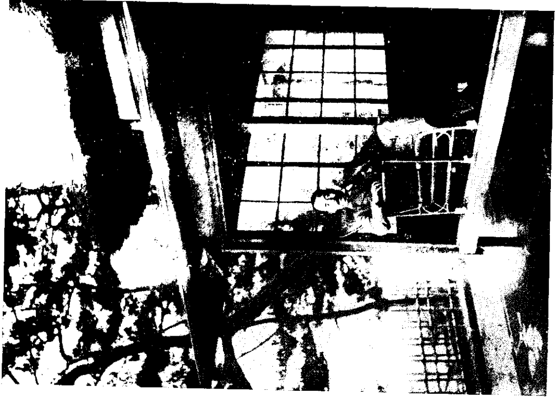
My father in his villa overlooking Kamakura beach