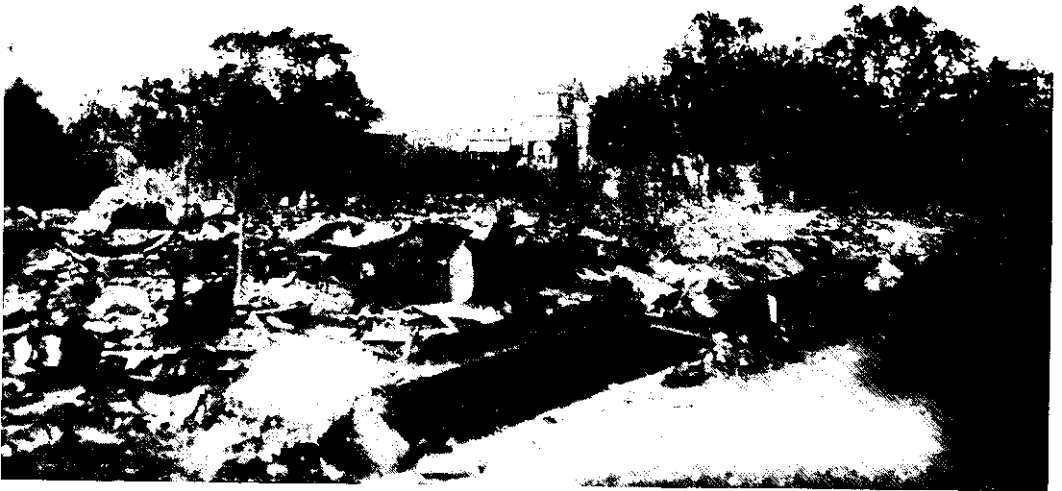
The ruins of my father's home after the earthquake in 1923