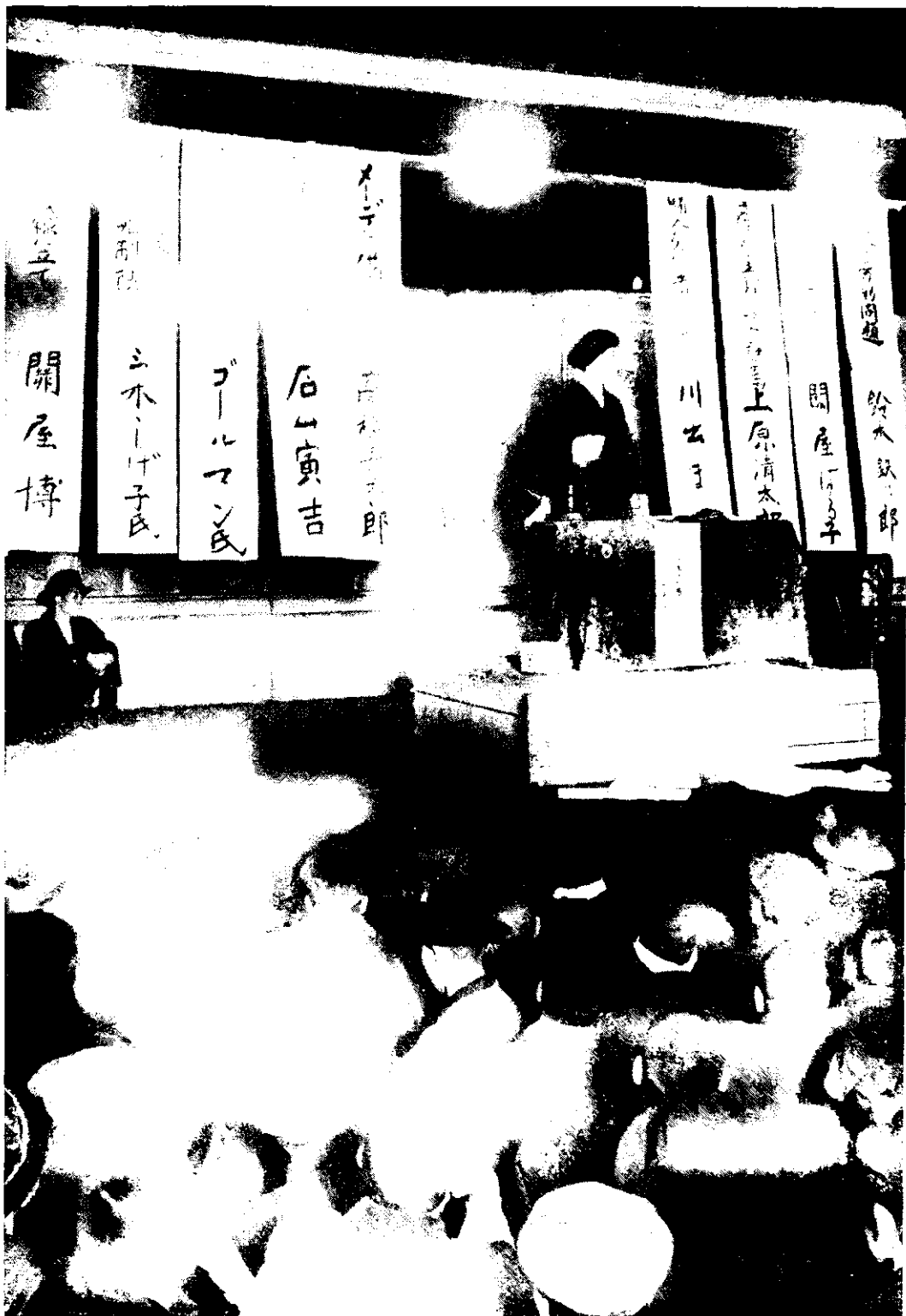
Addressing the miners at a country theatre at Ashio. The posters in the background carry slogans : " Prepare for May Day!" " Birth Control for Working Women!" etc.