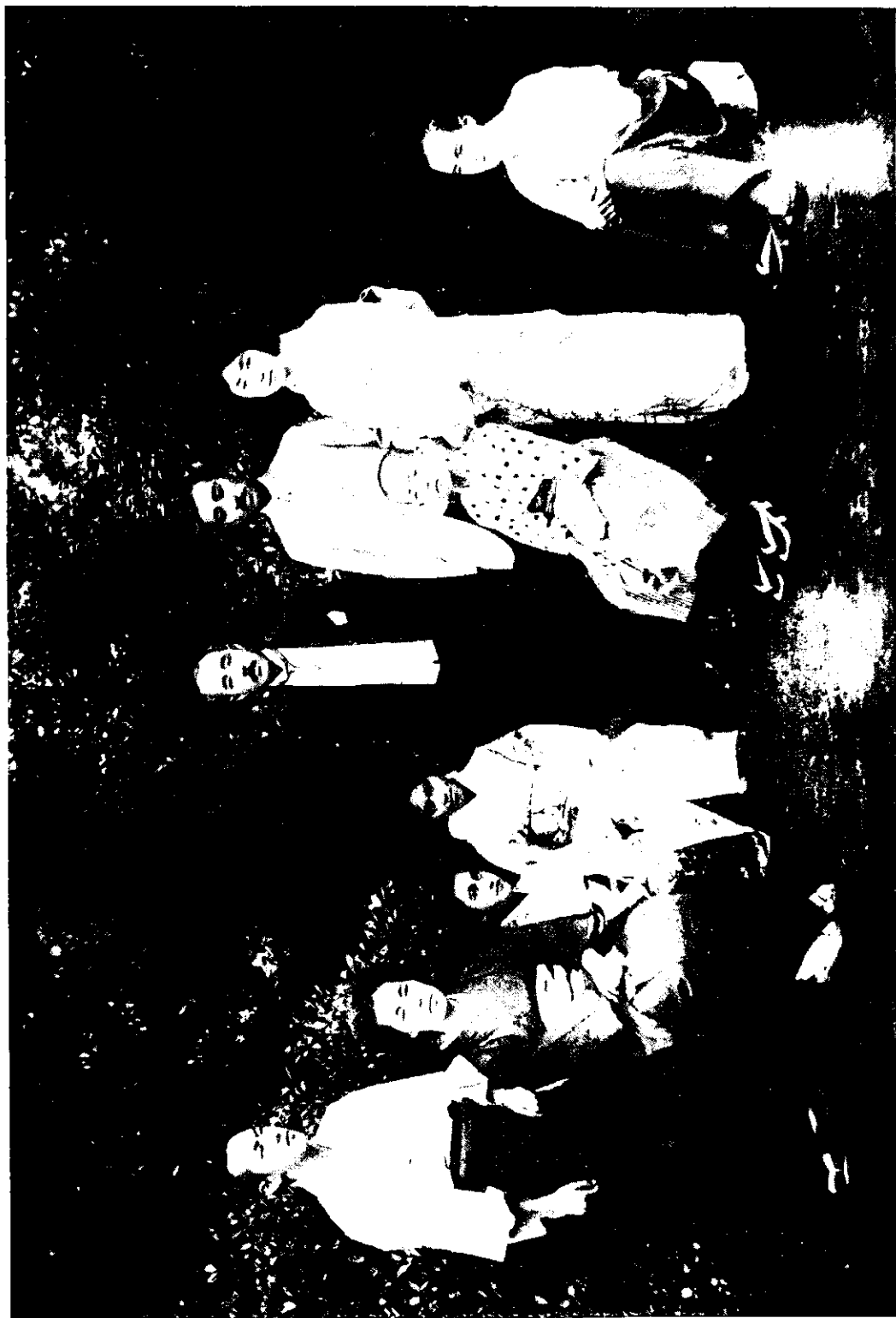
My father's family with my husband and myself shortly after our marriage