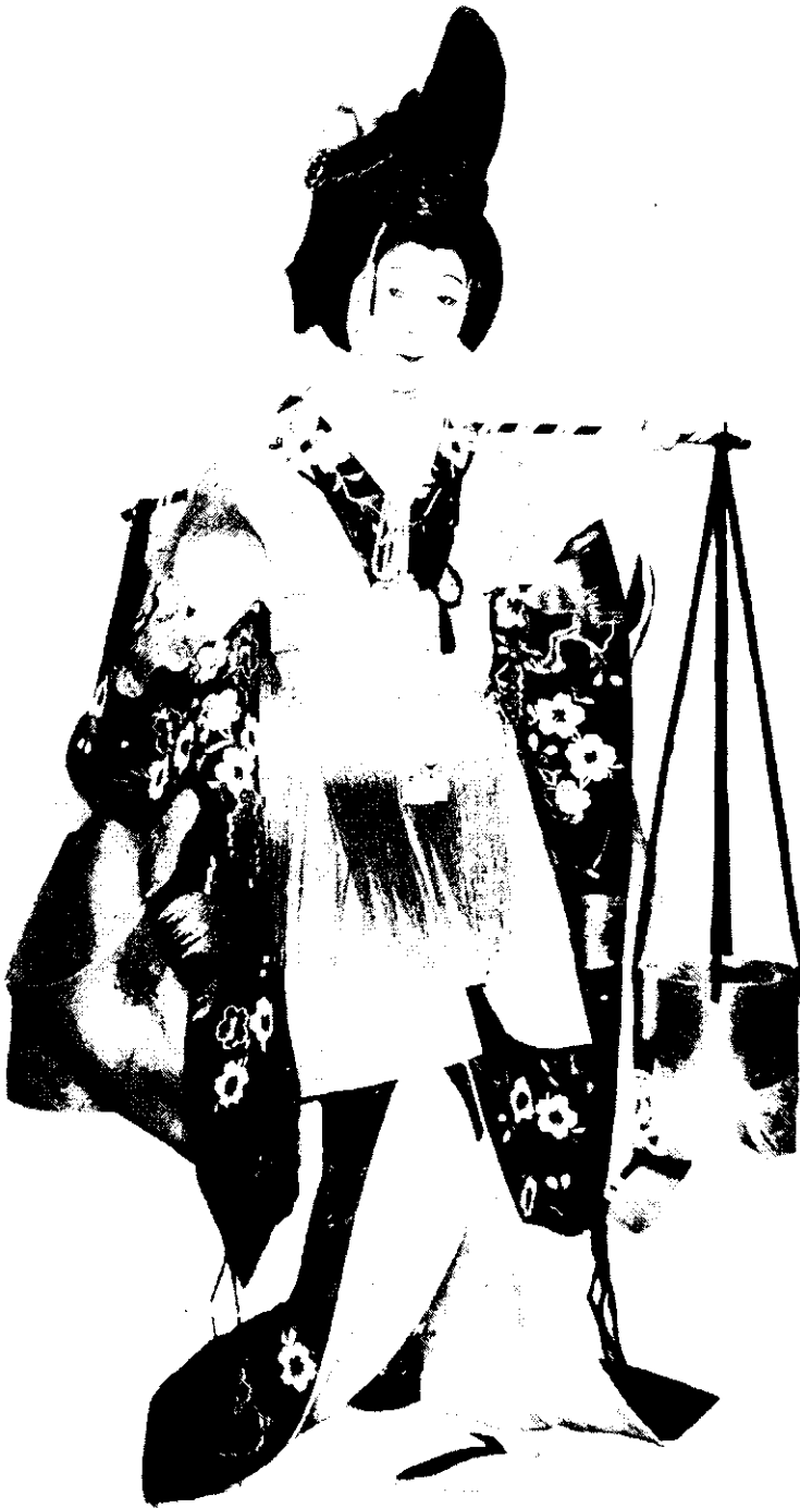
Myself in the fifteenth-century dance costume of the famous Kabuki theatre