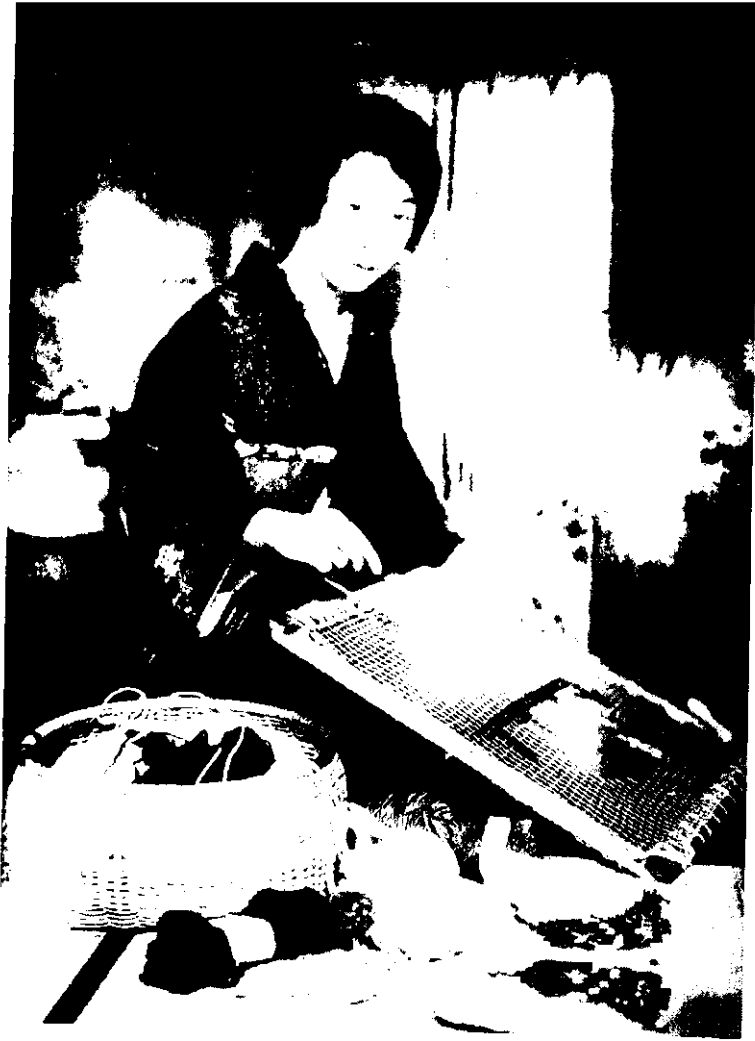
Working with yarn at my home