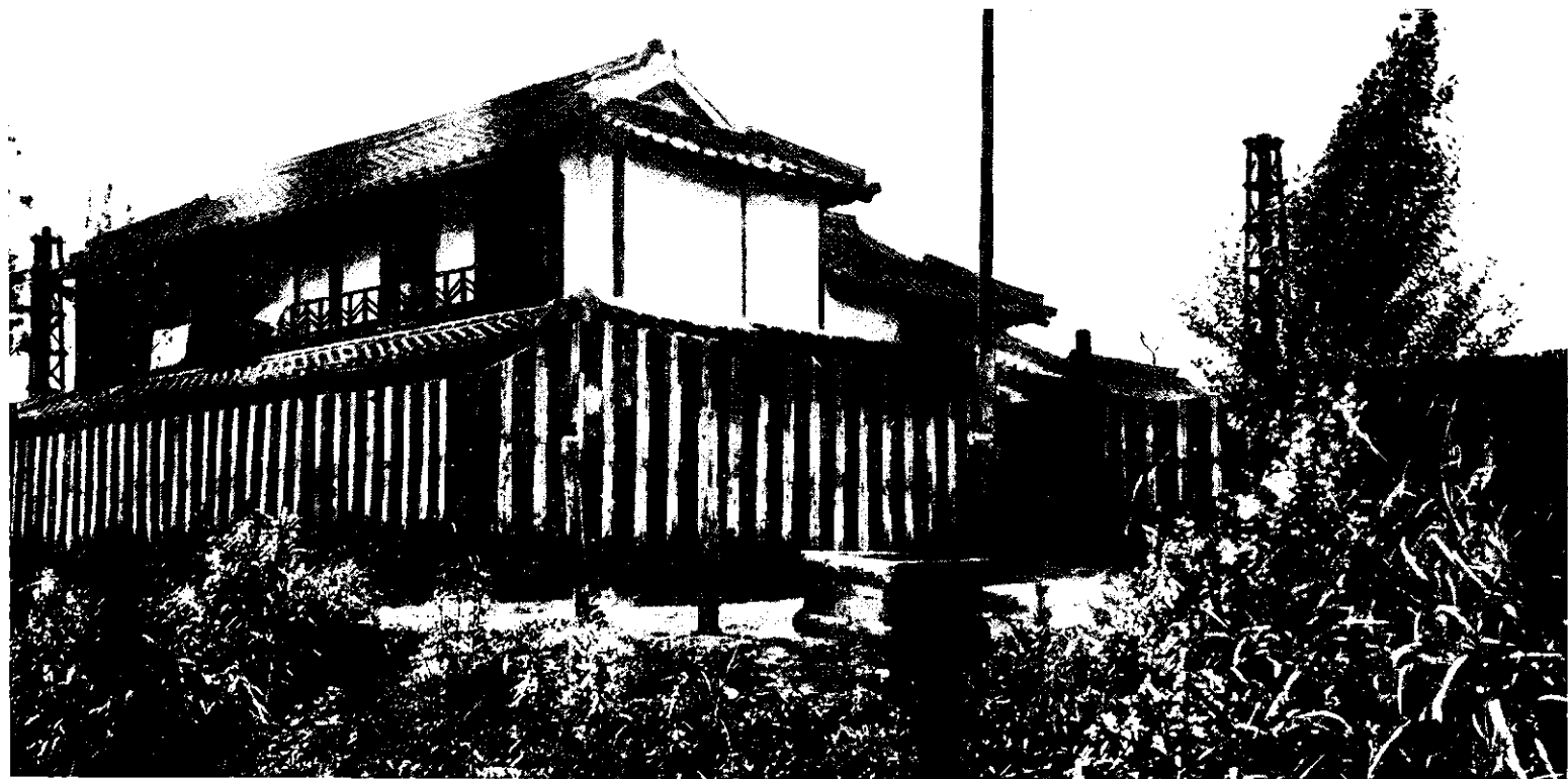
A paper carp flying on the flagpole celebrates the birth of our first son (An old Japanese custom still prevailing)