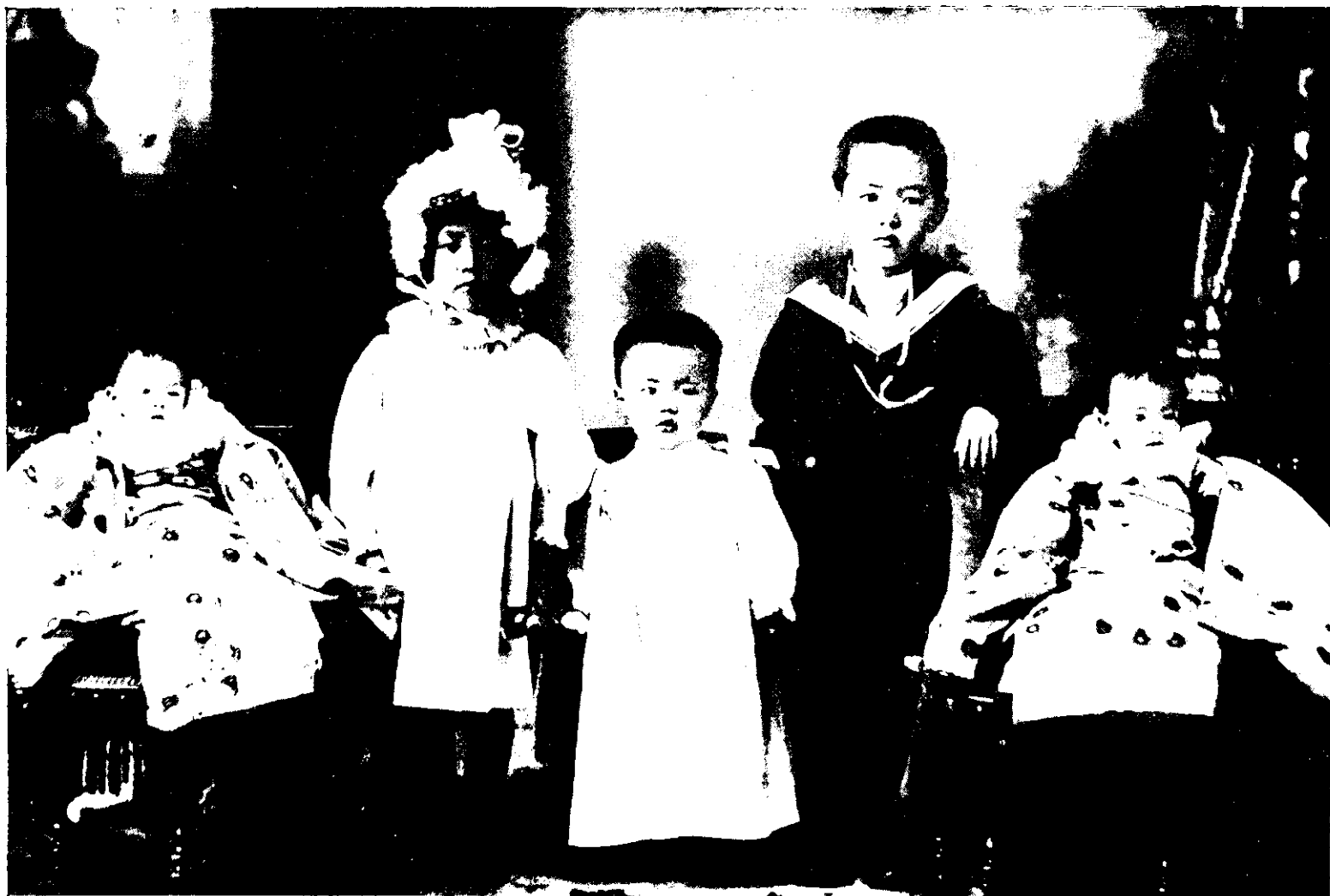
Myself with my brothers and twin sisters, in the clothes my father brought back from London