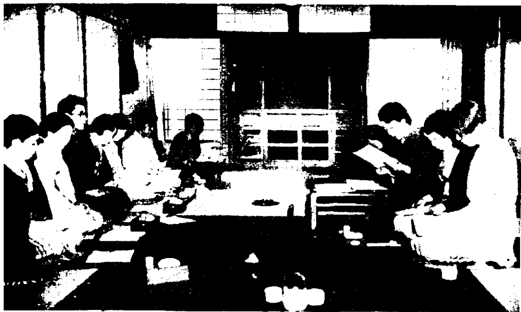
Reading a prospectus to a group which met to establish a branch office for the birth control movement in Osaka in 1932