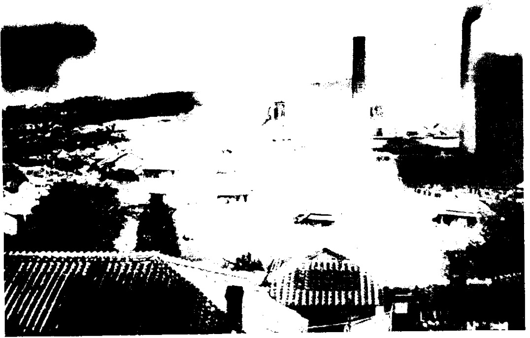
General view of Mitsui's Miike Colliery in Kyushu