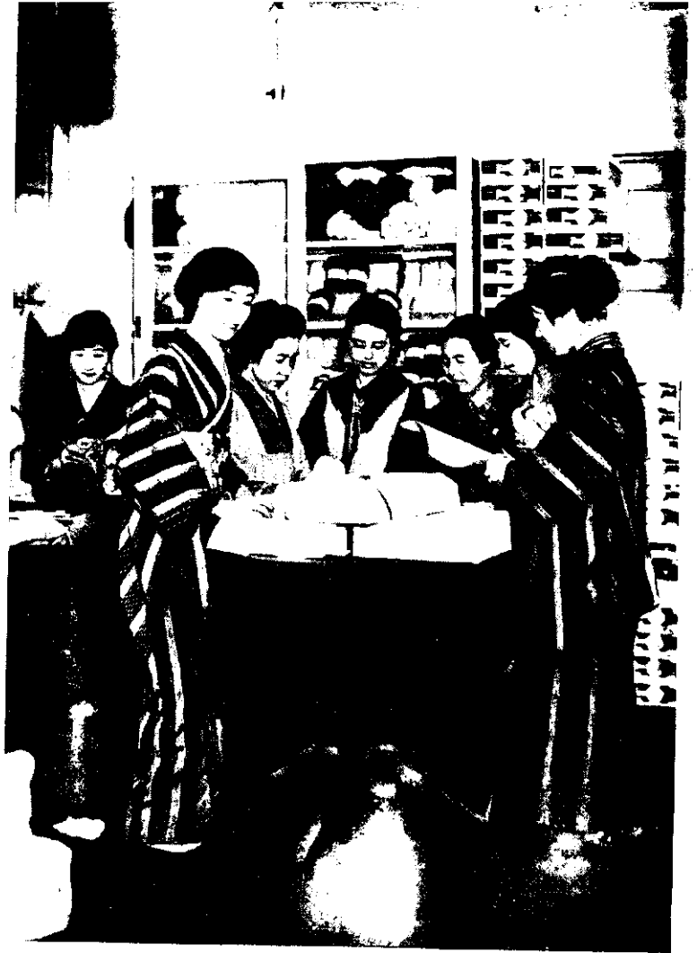
At the Minerva Yarn Shop in Kyobashi, Tokio