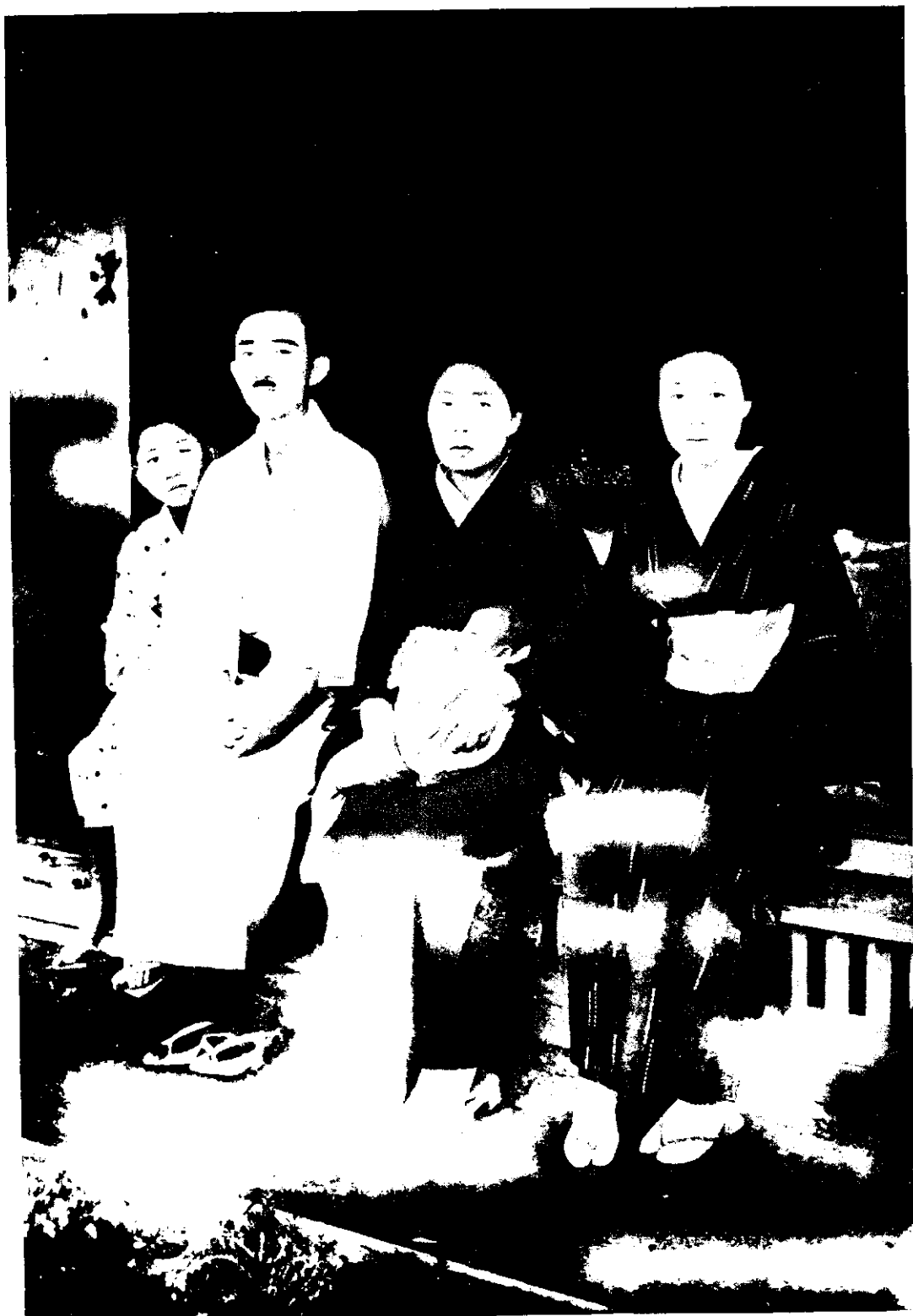
My husband's mother and brother with us and our son at Kyushu