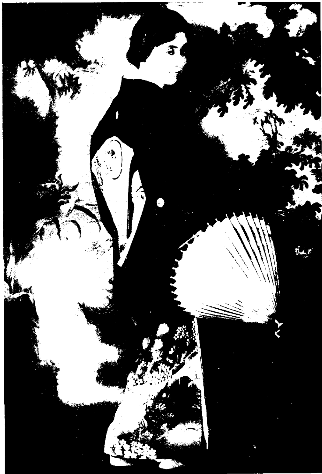
Myself in New York in 1924