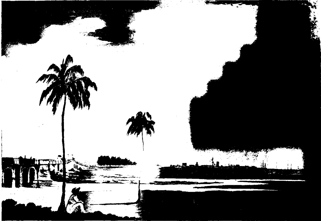
VIEW OF FORT ST GEORGE FROM ACROSS THE COUM. After a water-color sketch in the Ouseley Collection at the India Office.