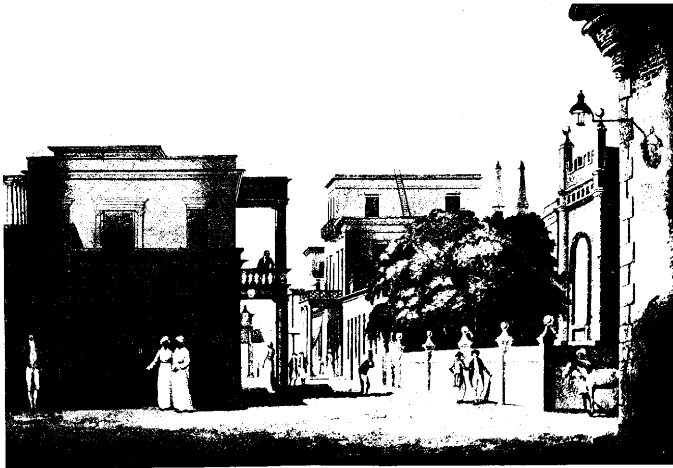
ST THOMÉ STREET IN FORT ST. GEORGE.