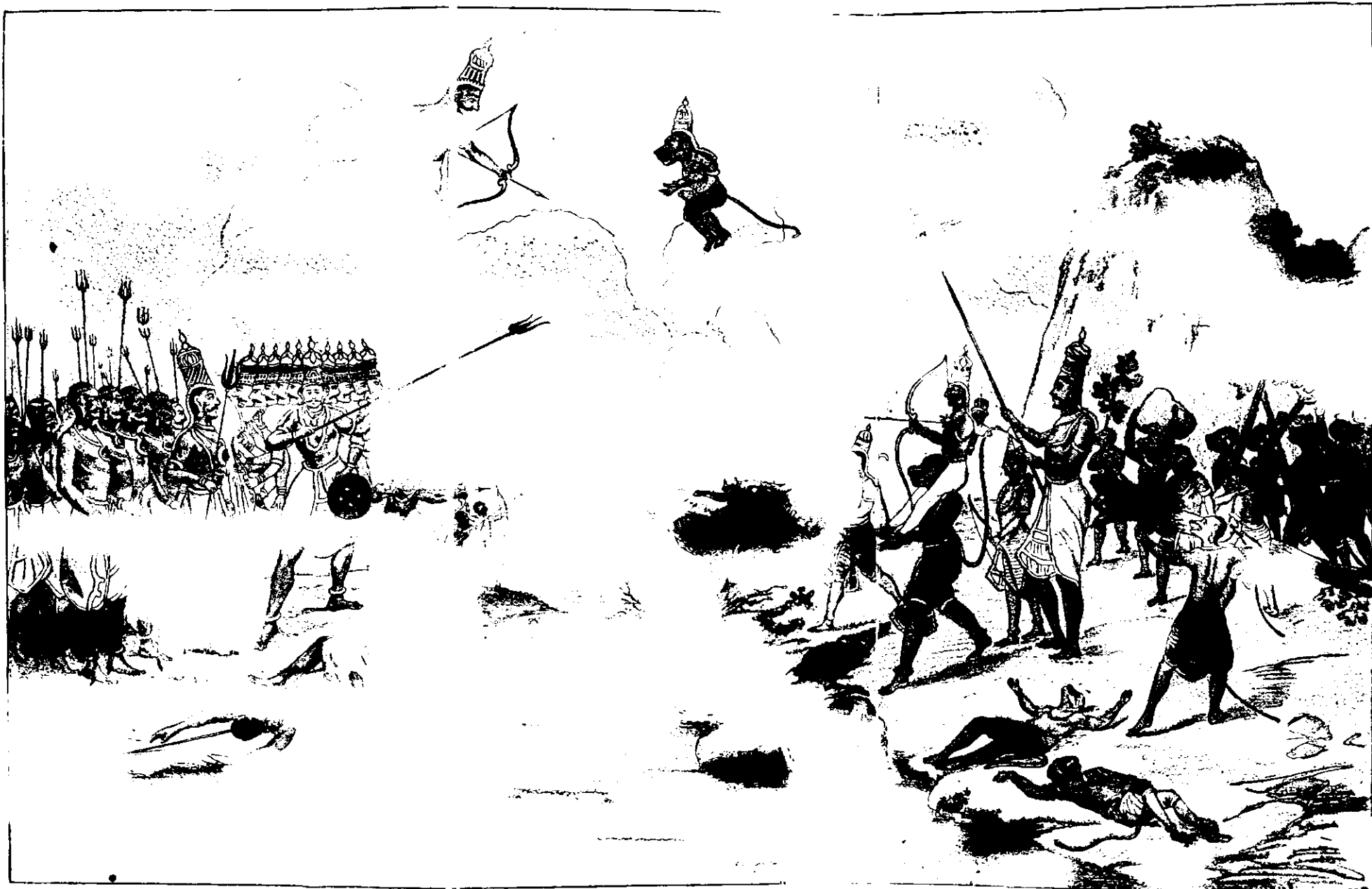
THE CONQUEST OF LANKA (ISLE OF CEYLON), BY THE ARMY OF HINDUS. FINAL BATTLE BETWEEN RAMA WITH HIS ARMY THE APES, AND RAVANA, THE DEMON-KING OF LANKA, WITH HIS ARMY OF BLACK RAKSHASAS (FIENDS). From the Rāmāyana.