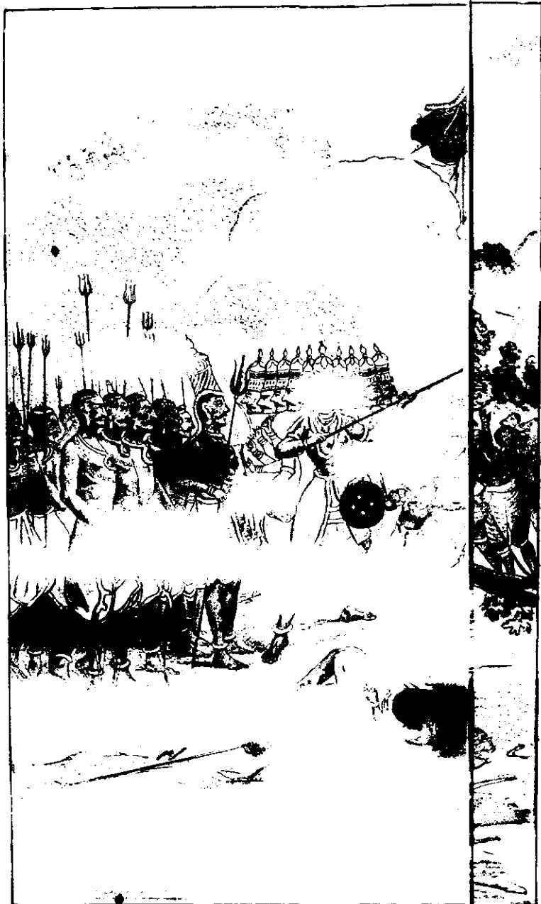
ANKA (ISLE OF CEYLON), BY THE ARYAN MY