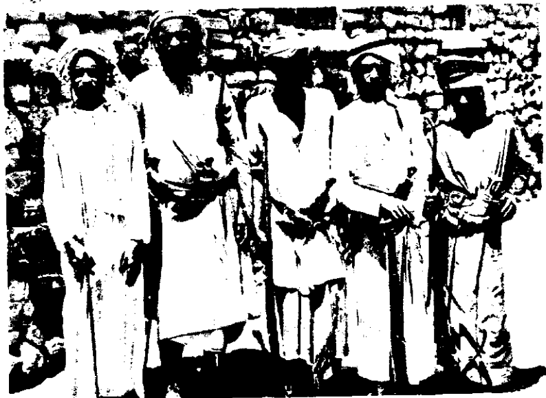
A slave-dealing Arab sheikh of the interior of Oman ( extreme left ) with four of his followers, each armed with Martini-Henry rifles.