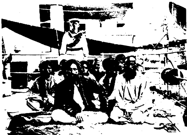
The mixed crew of an Arab dhow, from the Dasht-i-Shan coast of the Persian Gulf, aboard a British examination vessel.

SUPPRESSING THE SLAVE TRADE IN THE PERSIAN GULF