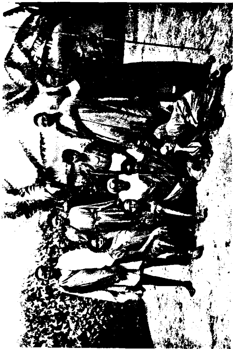
SUDANESE SLAVE GIRLS IN CAIRO RESCUE HOME (1889)