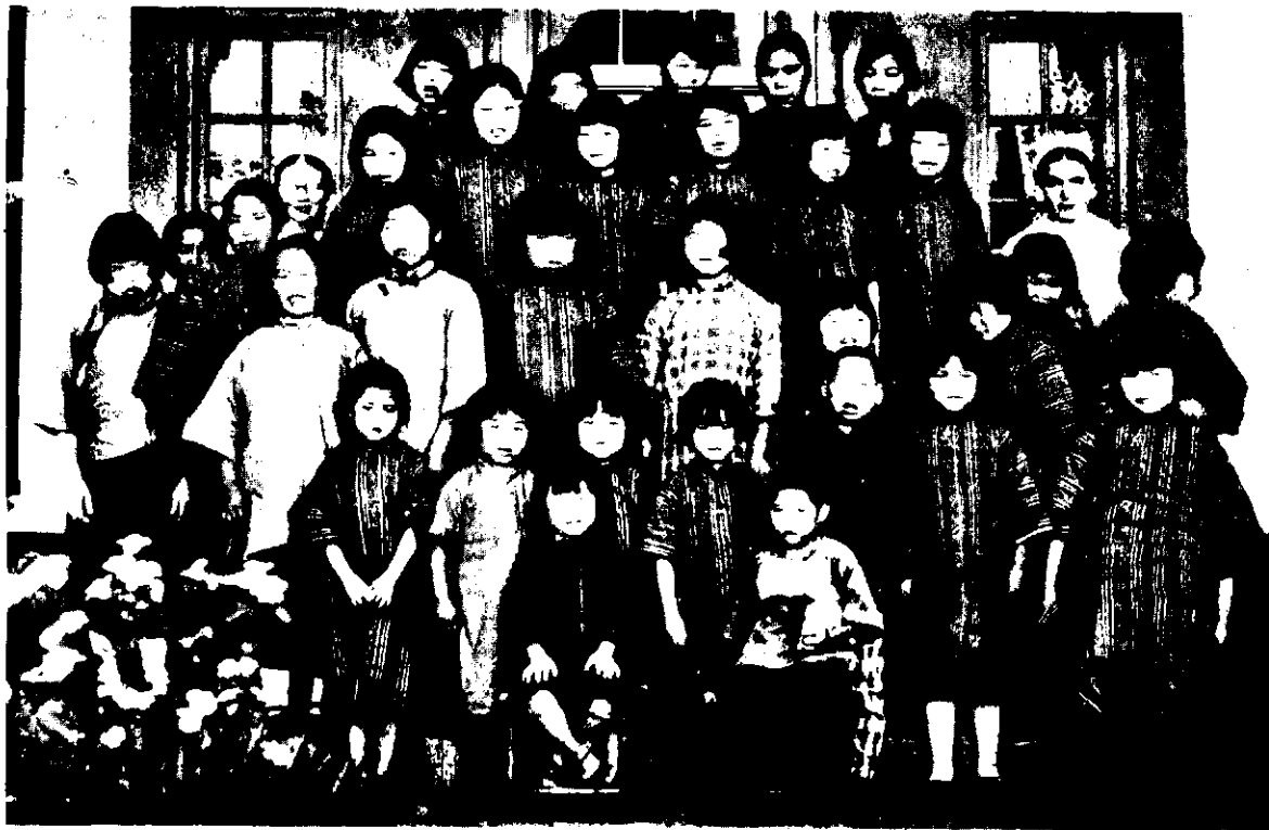
RESCUED MUI-TSAI CHILDREN IN A HOME AT YUNAN-FU, CHINA