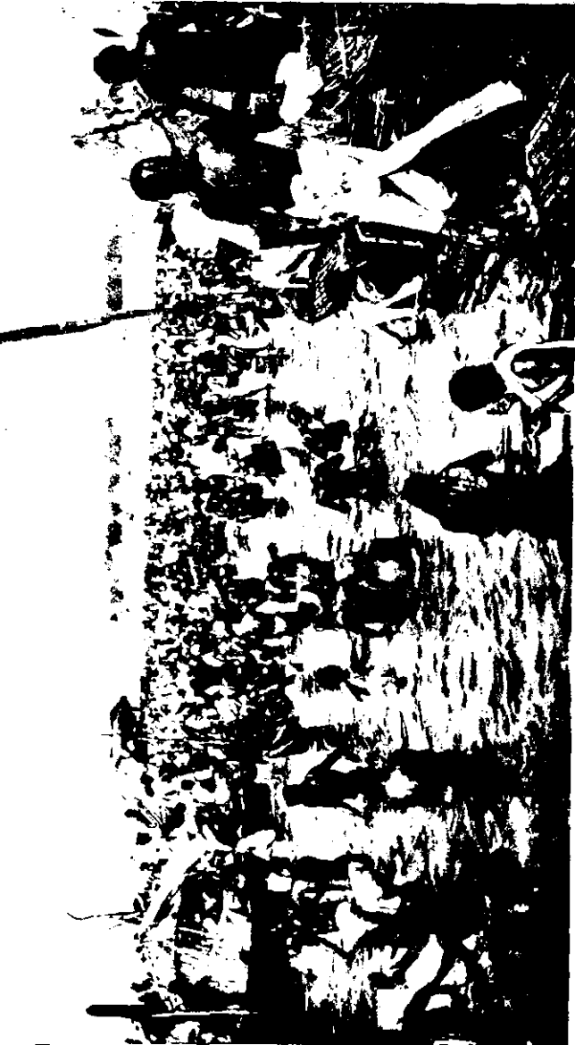
BATHING AT KUMBH MELA, ALLAHABAD