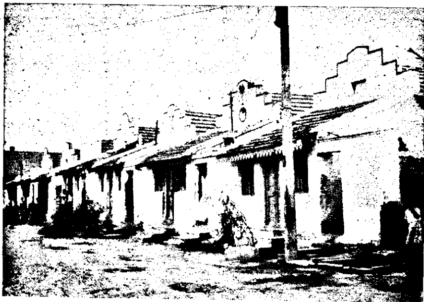
A VIEW OF THE SCAVENGERS AND SWEEPERS HOUSING COLONY AT JEEVANAHALLI, BANGALORE.