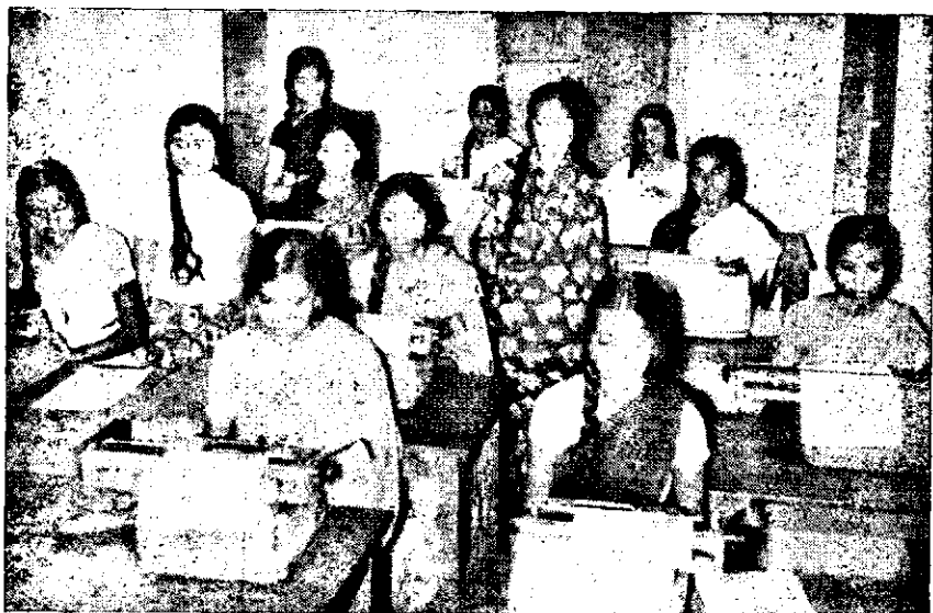
GIRL STUDENTS UNDERGOING TRAINING IN STENOGRAPHY AT THE OCCUPATIONAL INSTITUTE FOR WOMEN, GAURIBIDANUR.