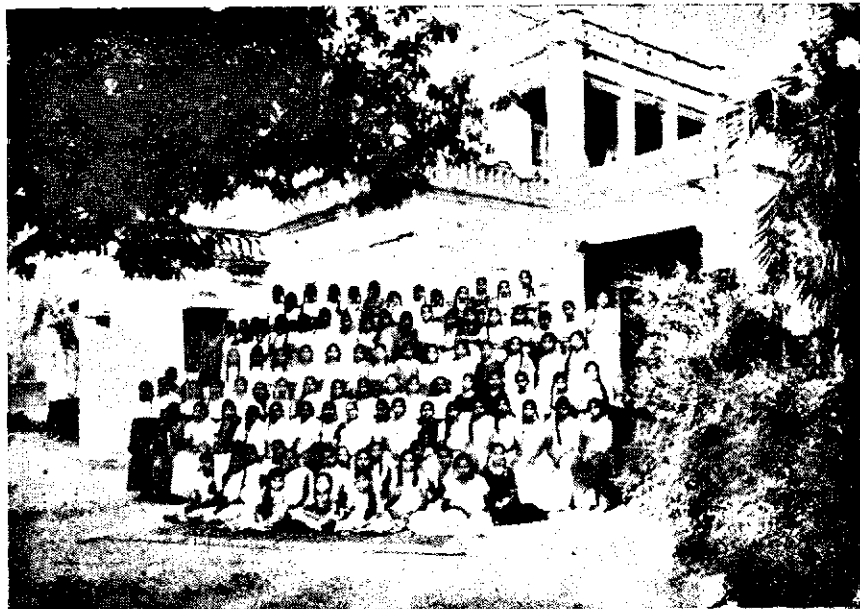
BOARDERS OF GOVERNMENT GENERAL HOSTEL, BASAVANGUDI, BANGALORE.