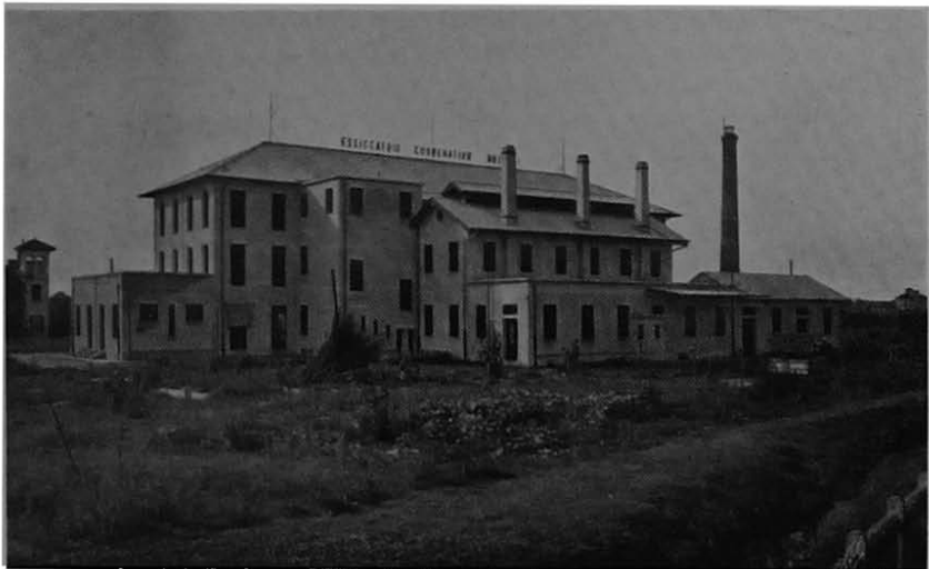
A CO-OPERATIVE SILK SOCIETY'S DRYING PLANT (PORDENONE)