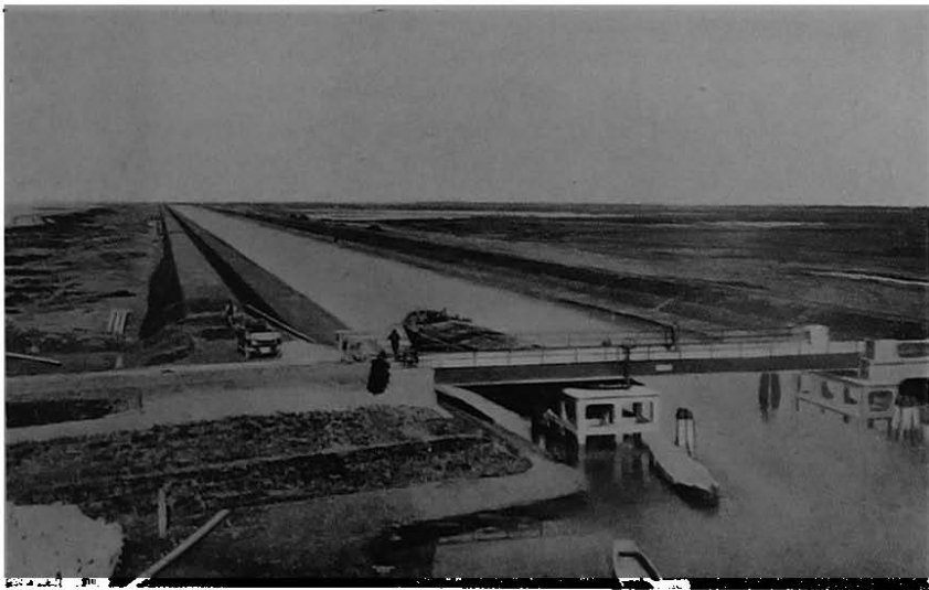
TYPICAL CO-OPERATIVE LAND RECLAMATION WORKS