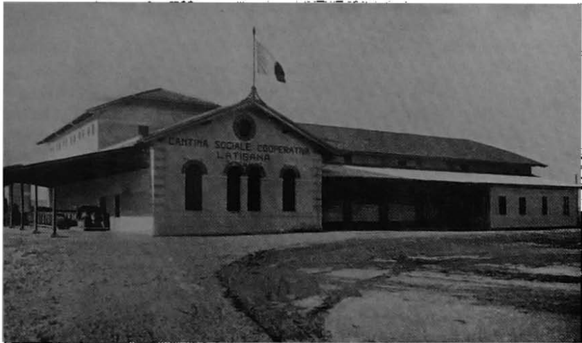
PLANT OF A CO-OPERATIVE WINE SOCIETY (LATISANA)