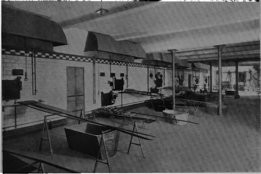
TYPICAL BAKERY OF A RETAIL SOCIETY (UDINE)