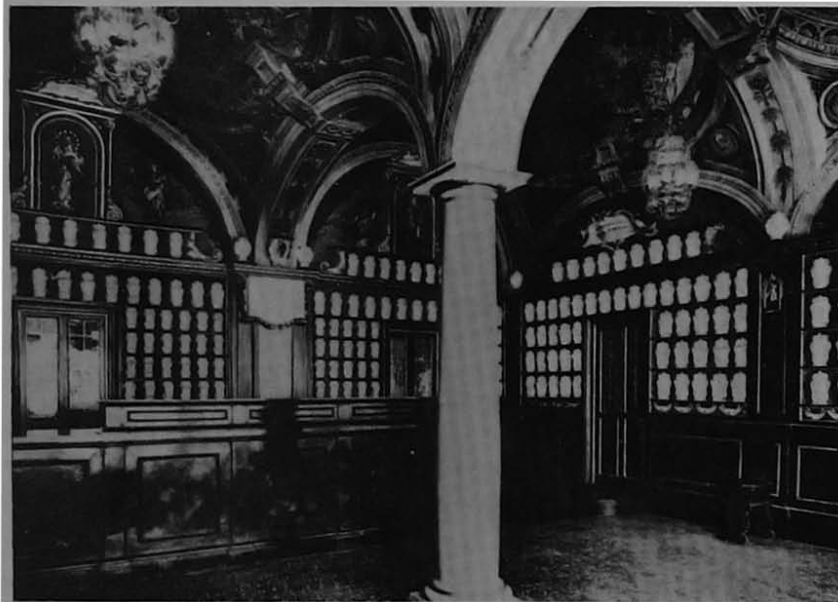
THE ANCIENT PHARMACY OF THE IMOLA RETAIL SOCIETY