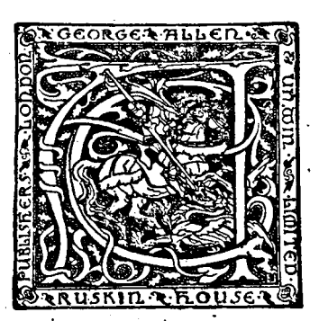
GEORGE ALLEN & UNWIN LTD. London: 40 Museum Street, W.C. I CAPE Town: 73 St. George's Street Sydney, N.S.W.: 218-222 Clarence Street Wellington, N.Z.: 110-112 Lambton Quay