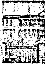
Judge Business School

For more information visit www.jbs.cam.ac.uk